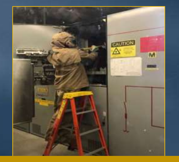
Testing & Switchover