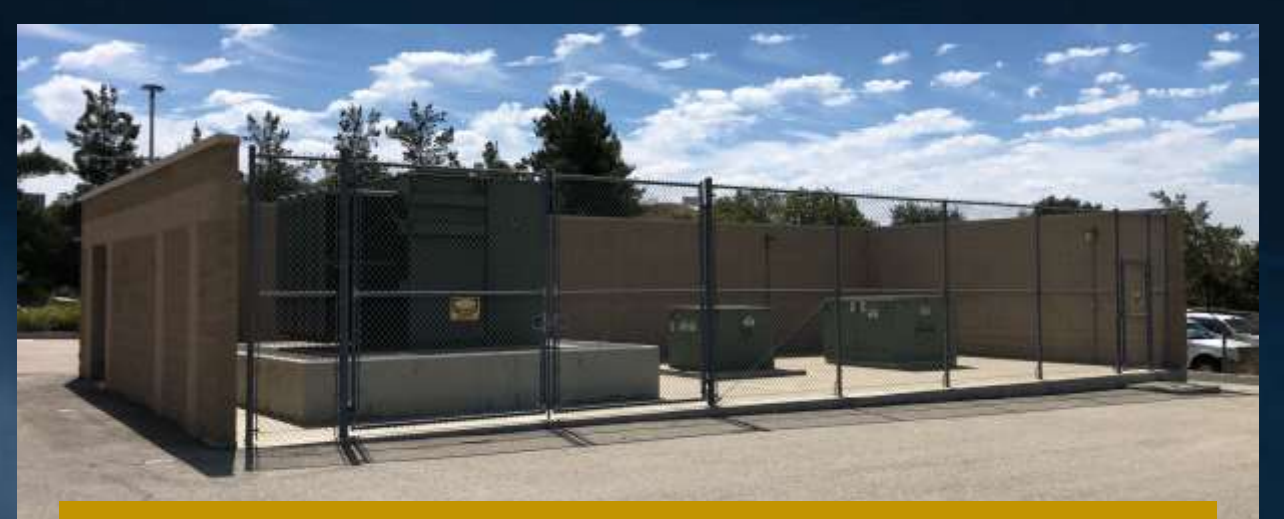
Mills Plant Existing RPU High-Voltage Switchyard