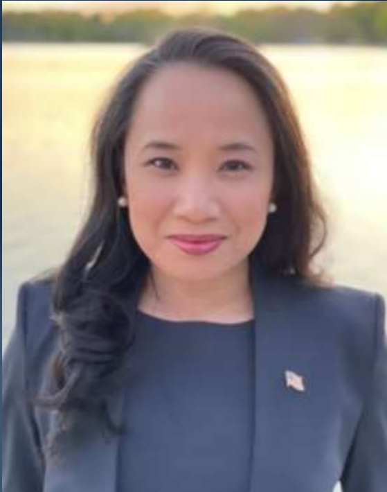
Camille Touton Commissioner Bureau of Reclamation U.S. Department of Interior