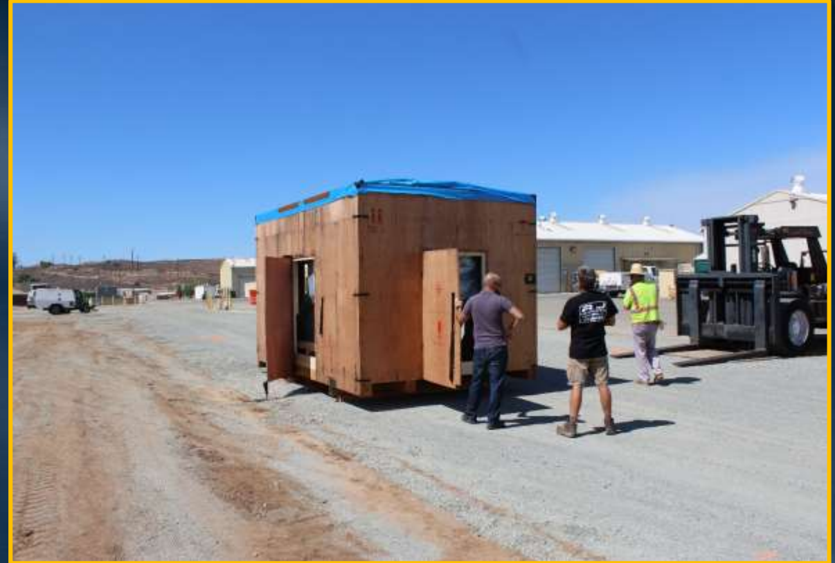
Visual Inspection of Valve Components