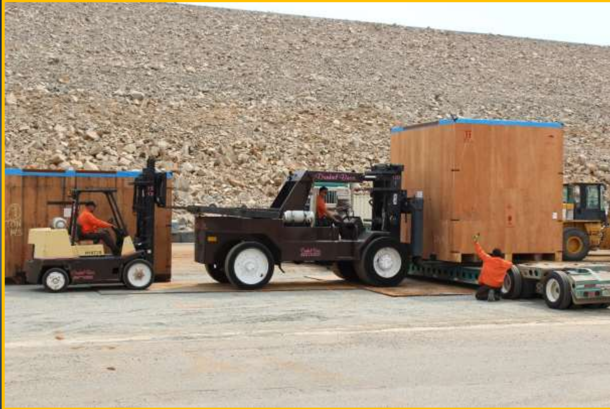
Delivery of Valve Body (inside protective crate)