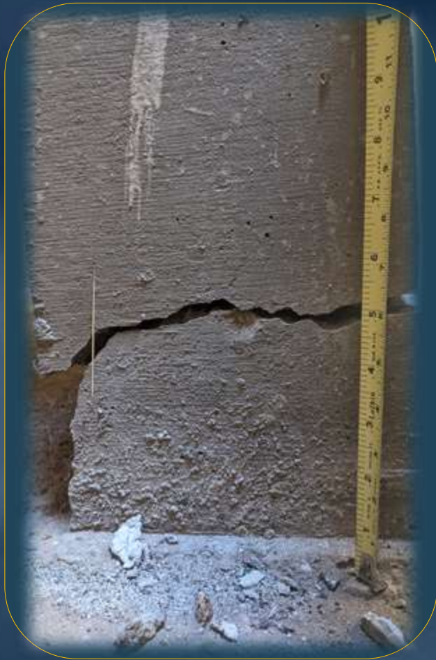
Cracked Pipe Support Pedestal