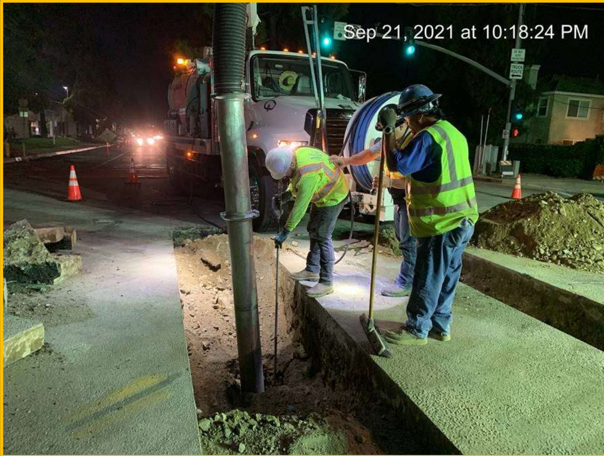
Excavating near Upper Feeder at I-10 and Monte Vista