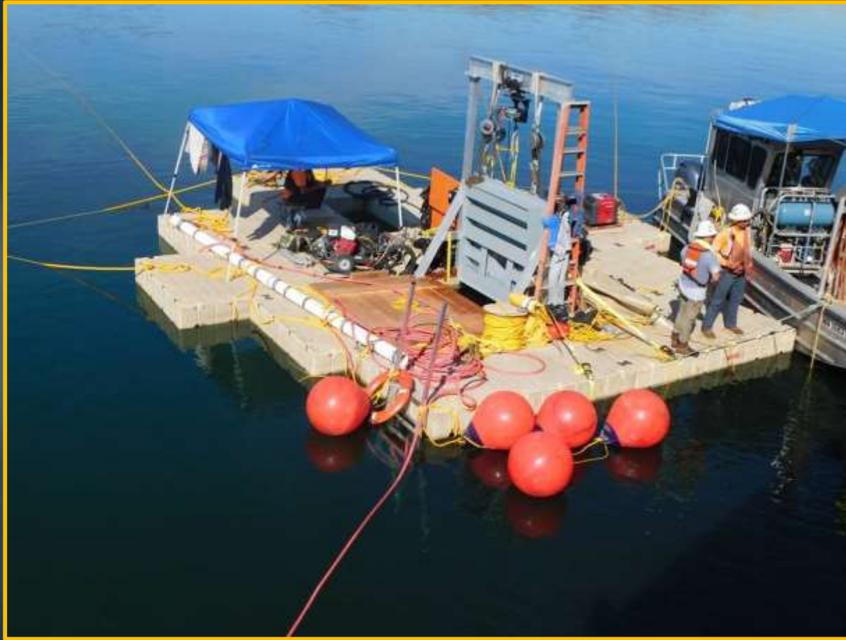
Barge Operation to Lower Isolation Device