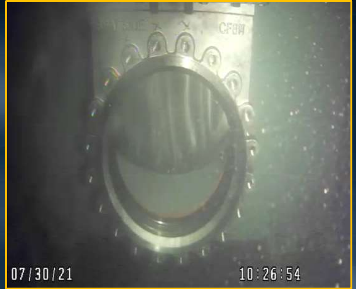
Knife gate valve in place – water side