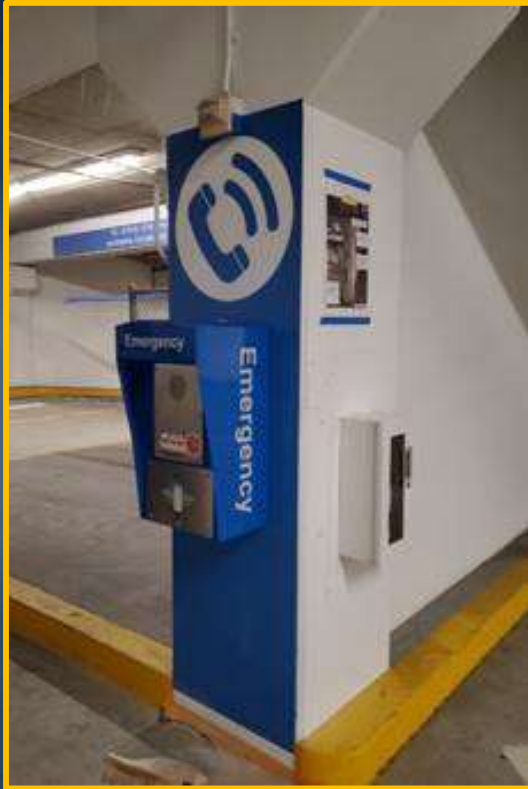
Headquarters Security Phase 2