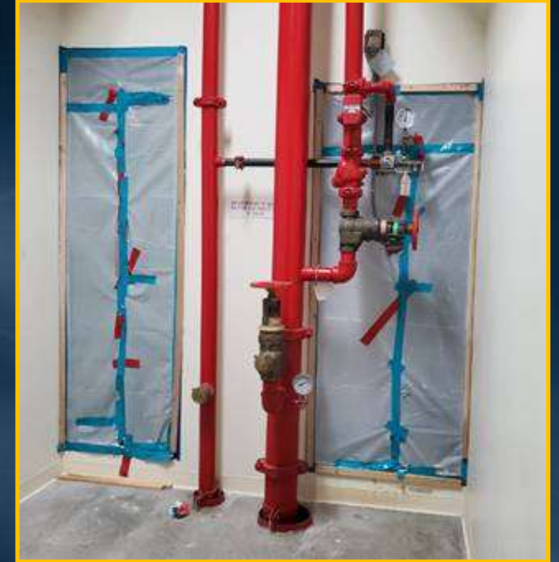
Headquarters Smoke and Fire Alarm Project