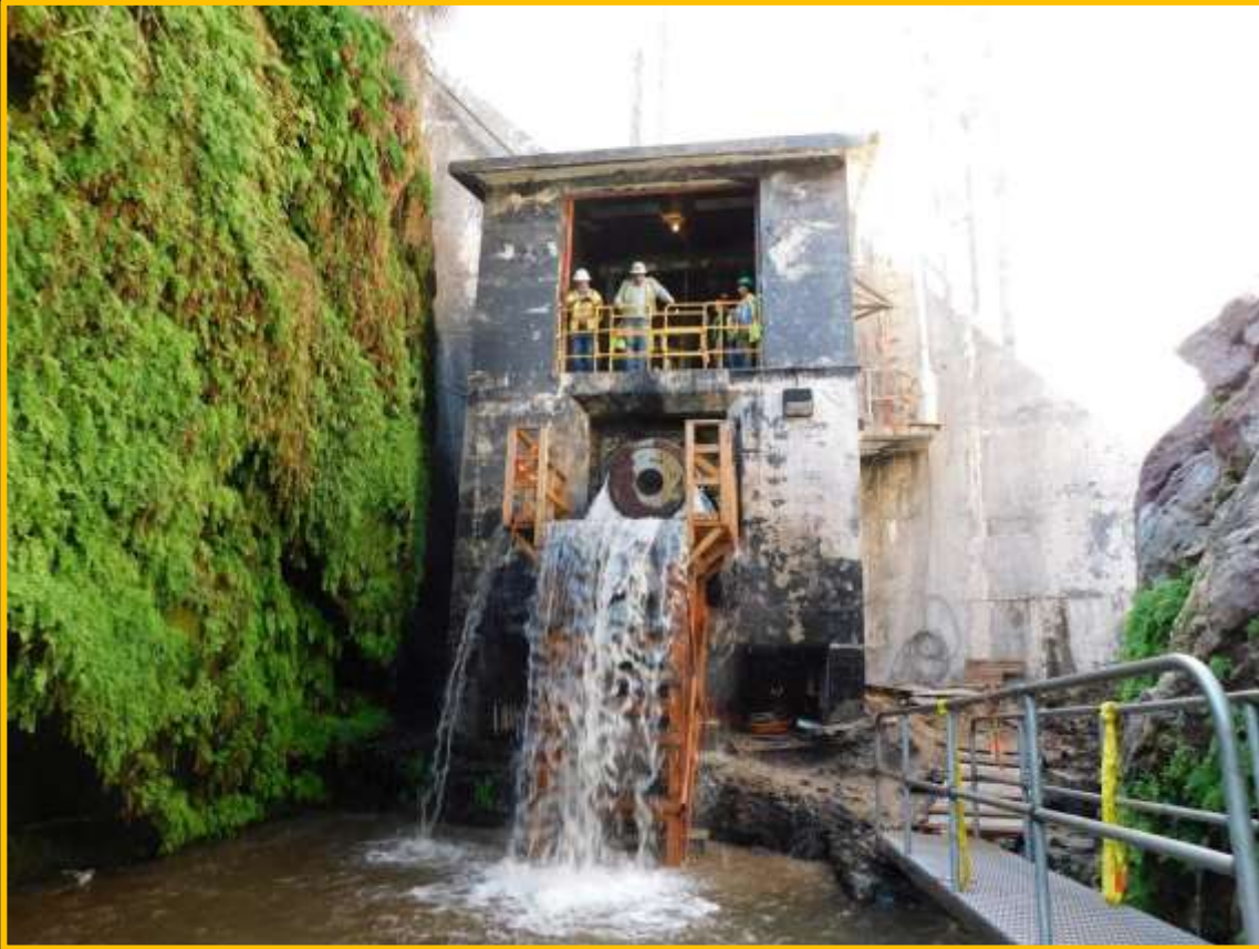
Draining Discharge Tunnel