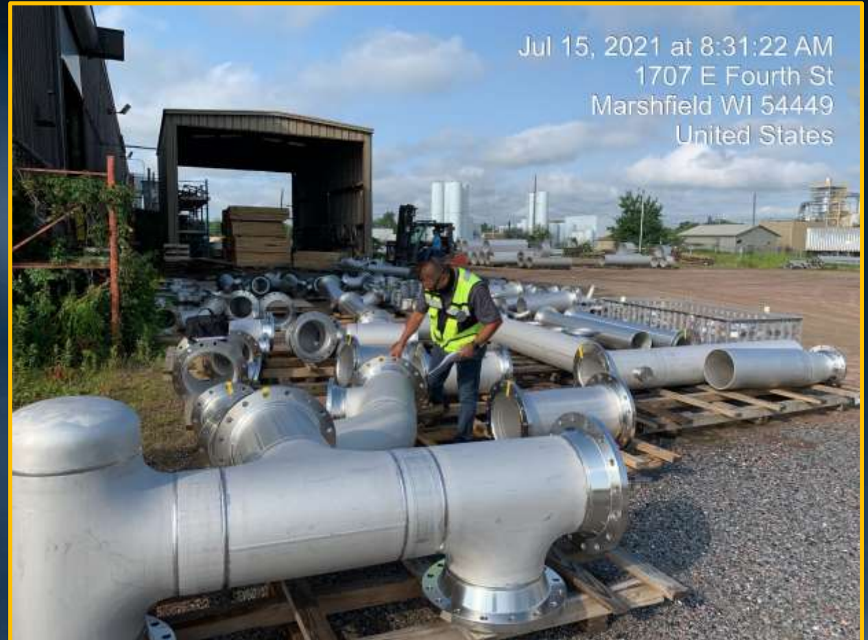
Inspection of the 12" and 16" diameter Pipe