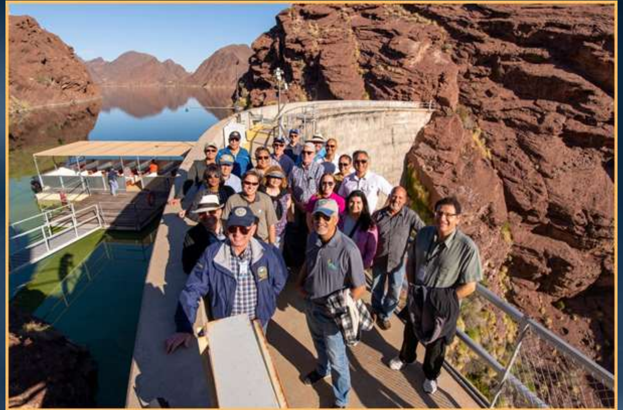
2019 Inspection Trip to CRA Facilities