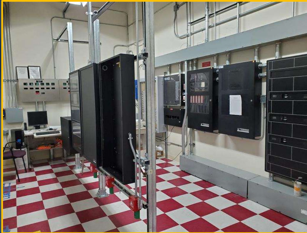
Main Fire Control Room