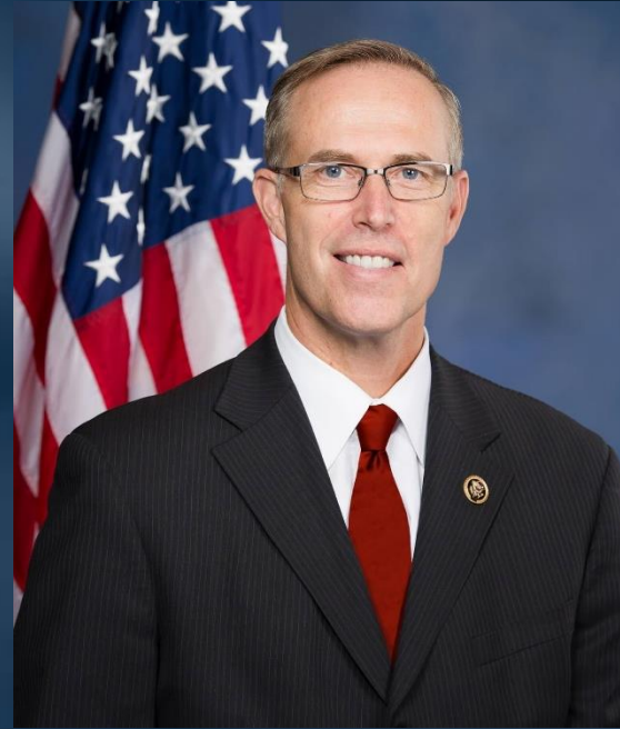
Jared Huffman (D-CA)