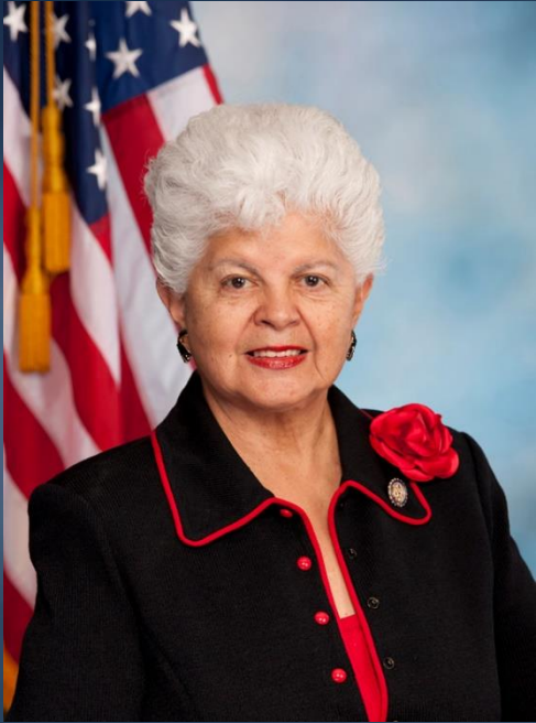
Grace Napolitano (D-CA)