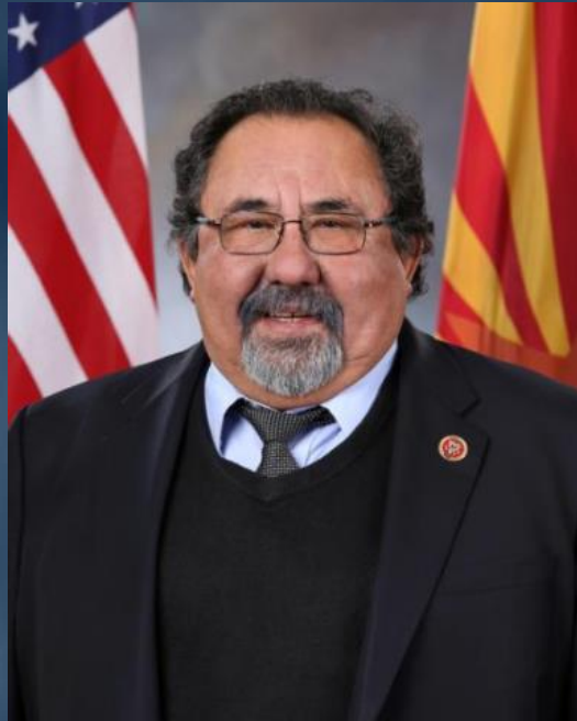
Raul Grijalva (D-AZ)