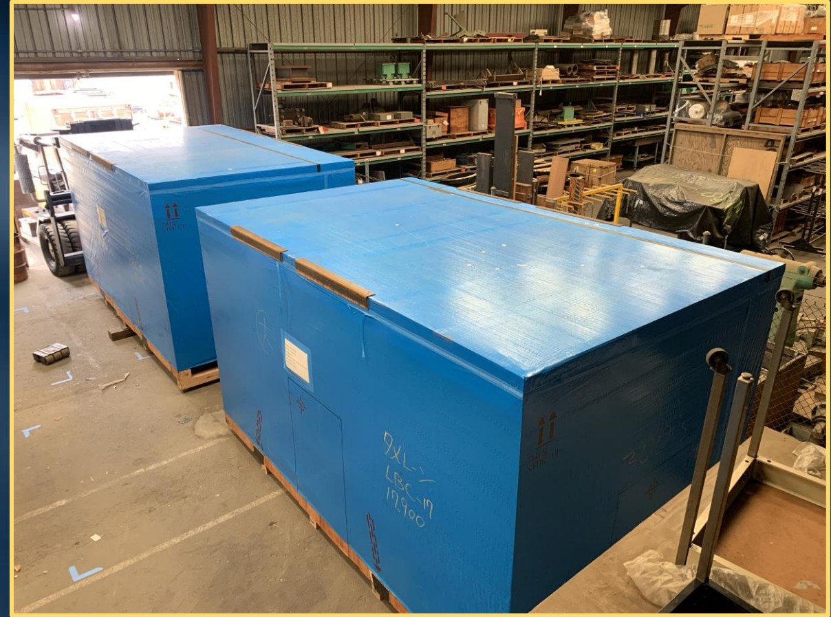
Valve delivery at storage at La Verne warehouse