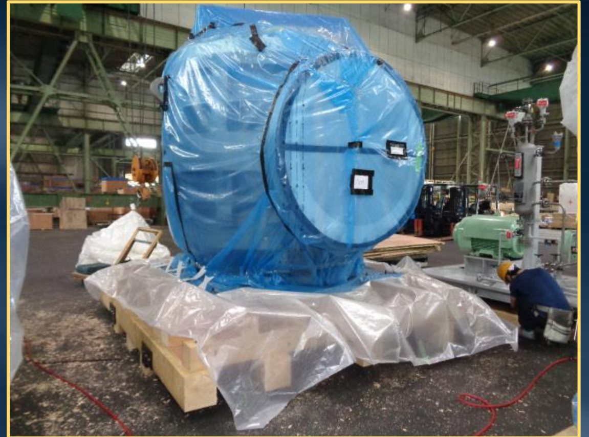
48-inch valve fabrication and packaging prior to shipment