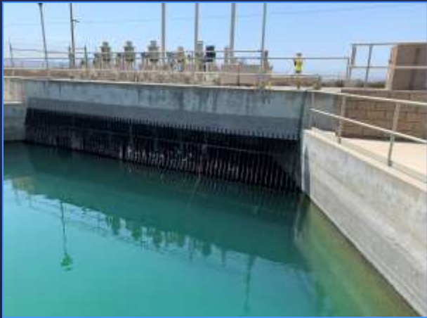
Bypass Channel Inlet