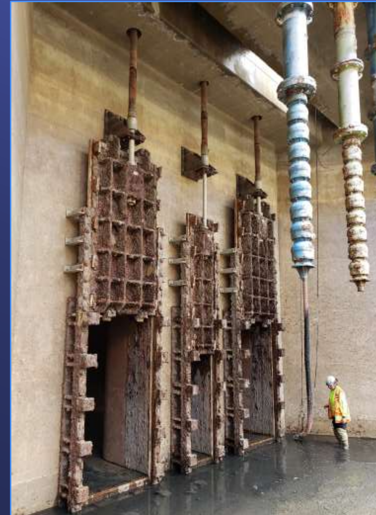
Slide Gate Assemblies