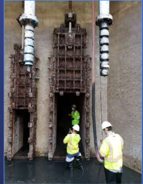
Slide Gate Assemblies