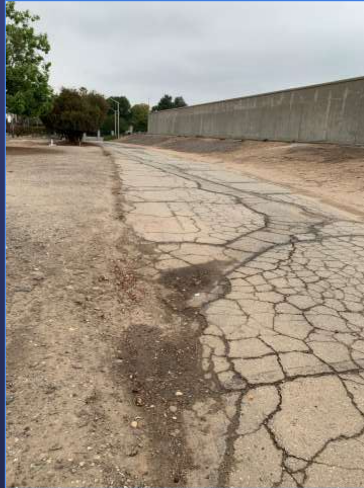
Service Road - South Side of Finished Water Reservoir