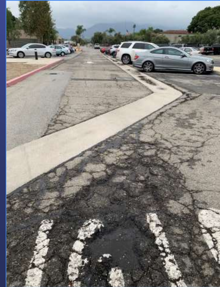
Parking Lot Area – North of Finished Water Reservoir