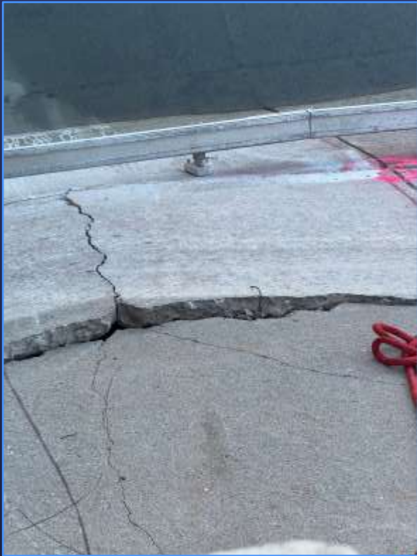
Example of buckled concrete canal panels