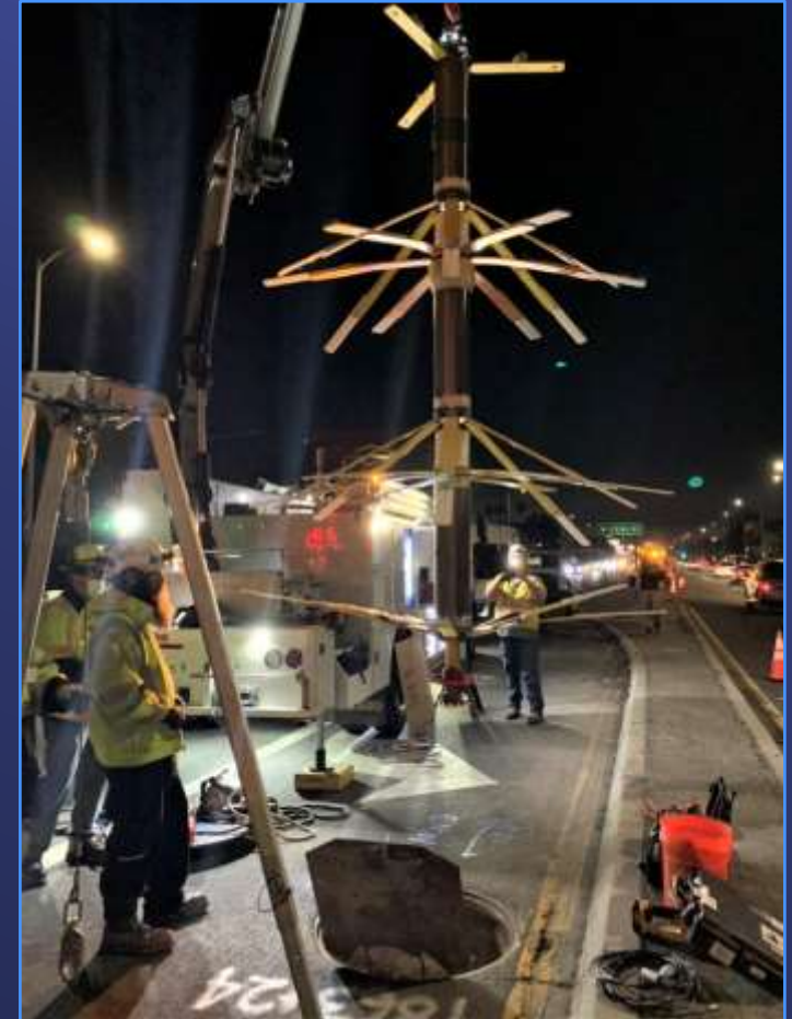
Insertion of PipeDiver for electromagnetic inspection of Sepulveda Feeder