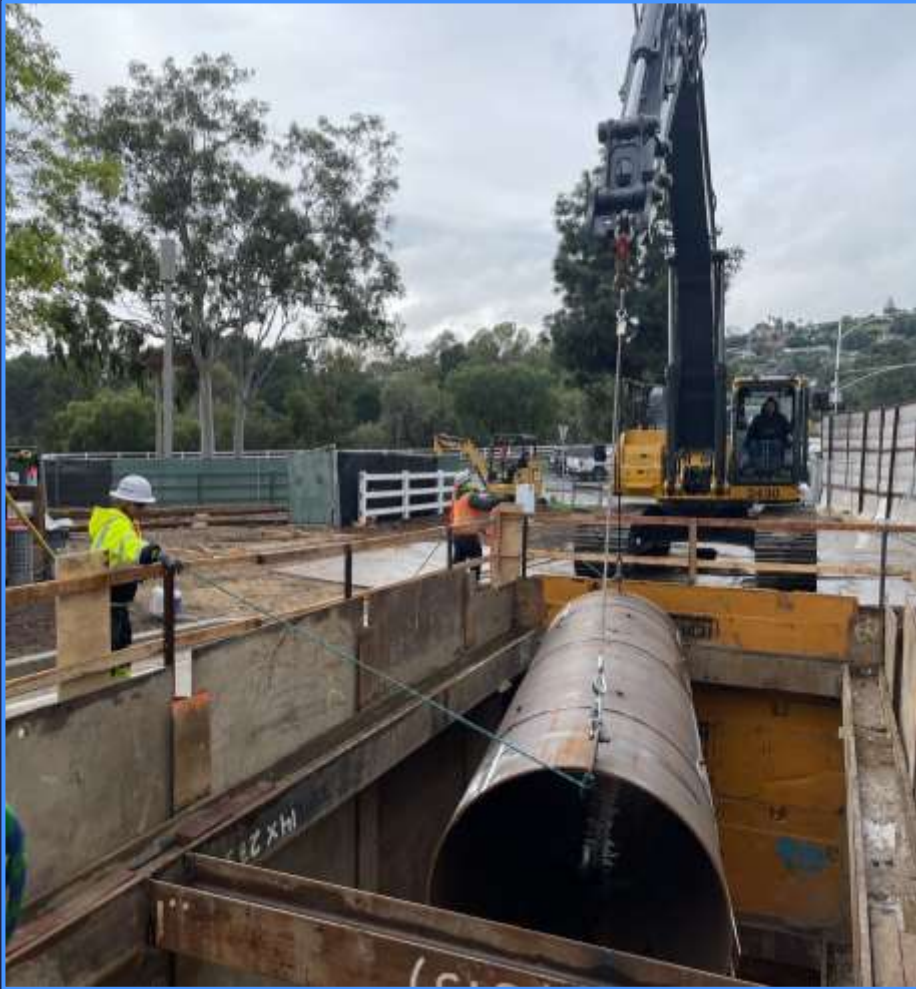
Contractor lowers steel liner into the pipeline