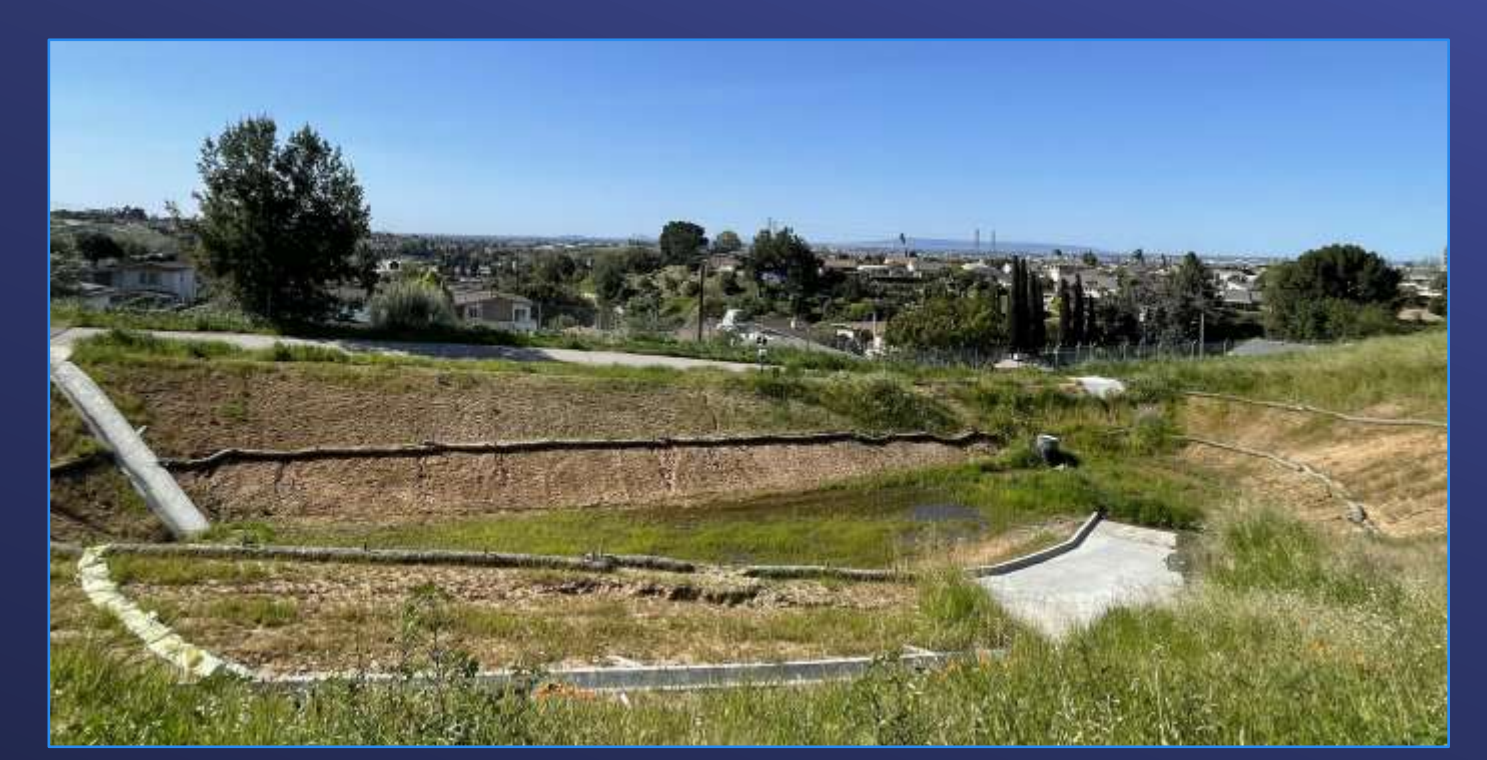
New Runoff Impoundment Area (Multiple sites on reservoir property)