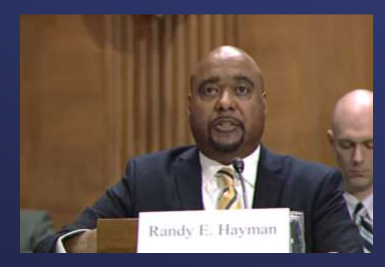
Senate Environment and Public Works Committee