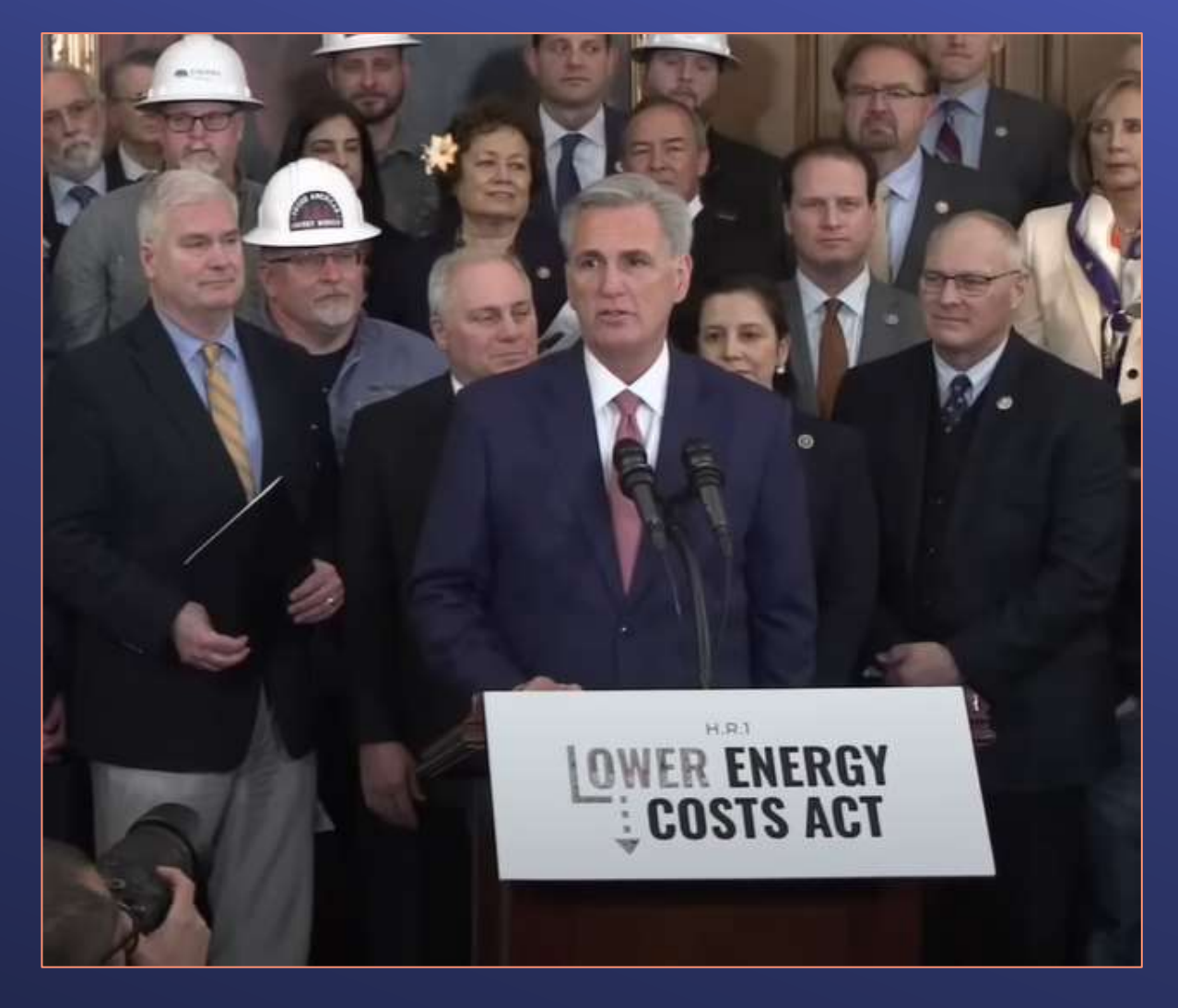
H.R. l: The Lower Energy Costs Act