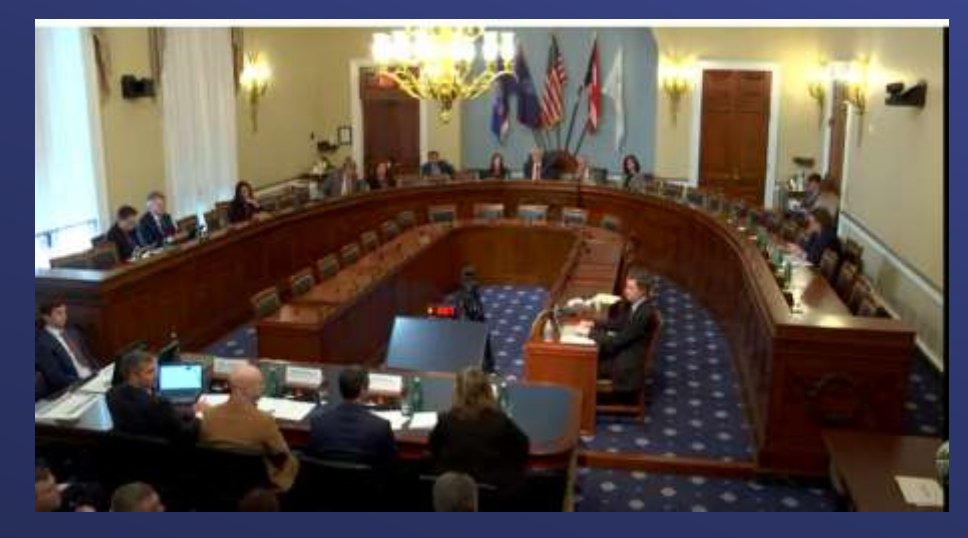
House Natural Resources Subcommittee on Water, Wildlife and Fisheries