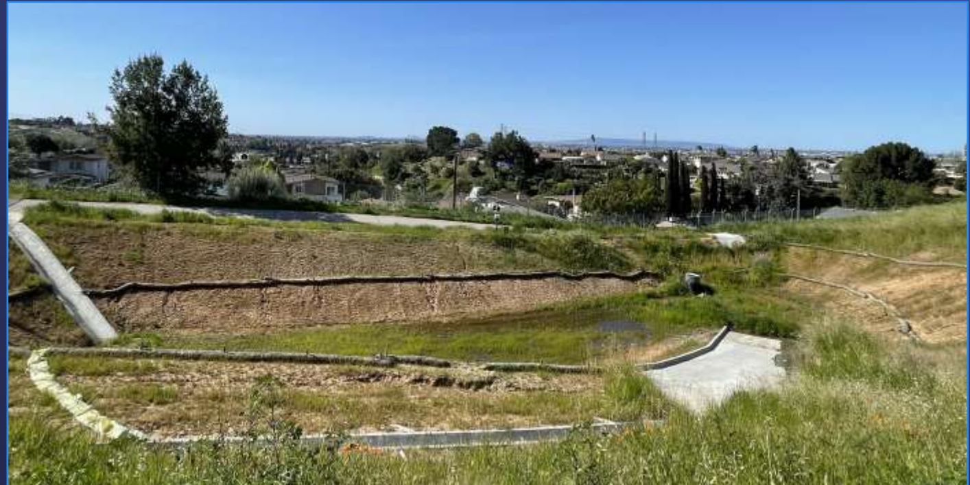
New Runoff Impoundment Area (Multiple sites on reservoir property)