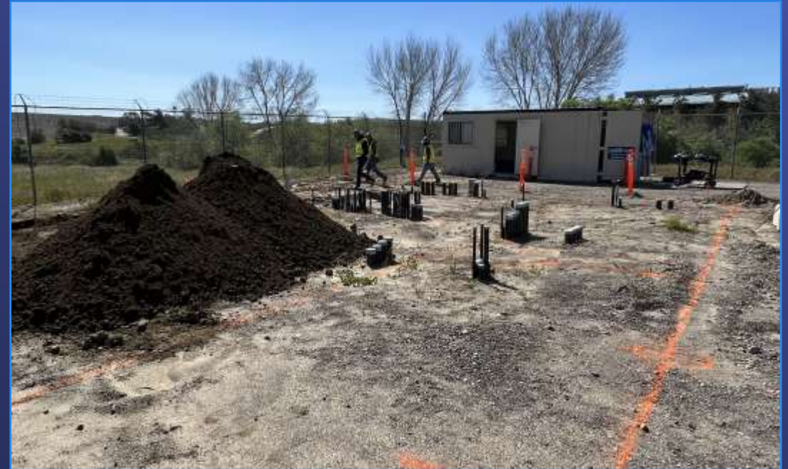
Installation of Underground Electrical Duct Banks