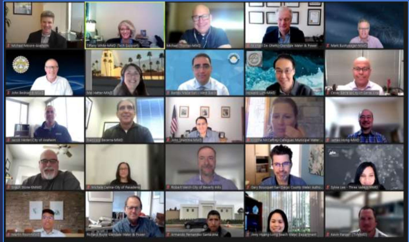
2022 Virtual Event