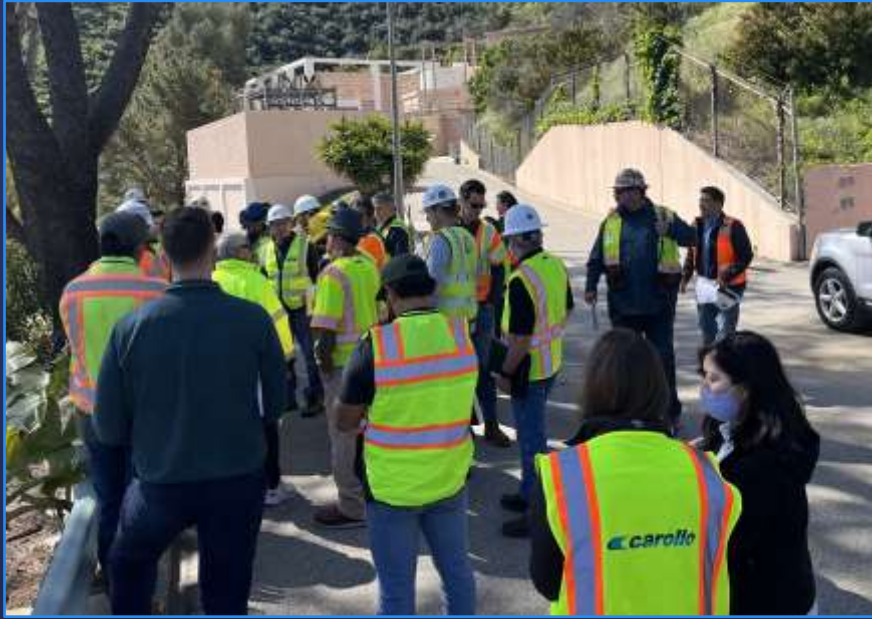
Job Walk Participants