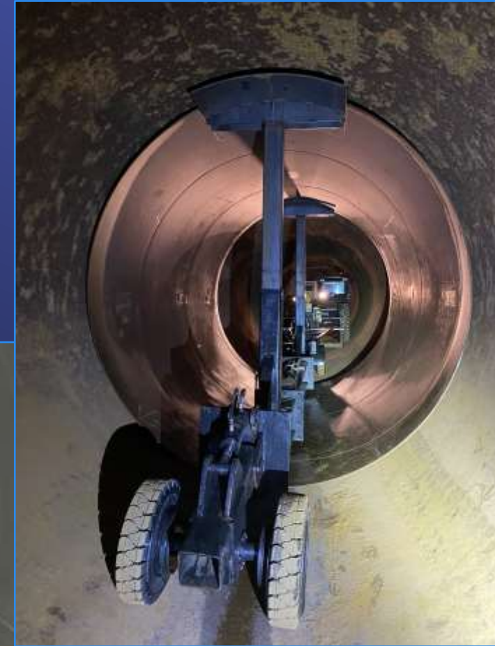
Installation of New Steel Liner