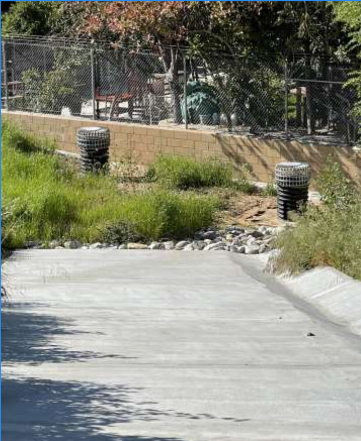
New Block Wall, Stand Pipes & Vee Ditches to Control Off-site Drainage