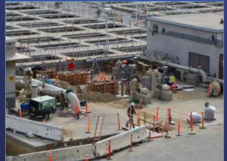
Structural & Civil Construction