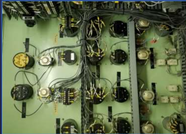
Electrical & Control System Construction