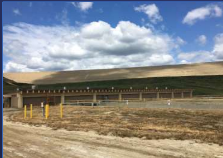
Exterior of Control Building