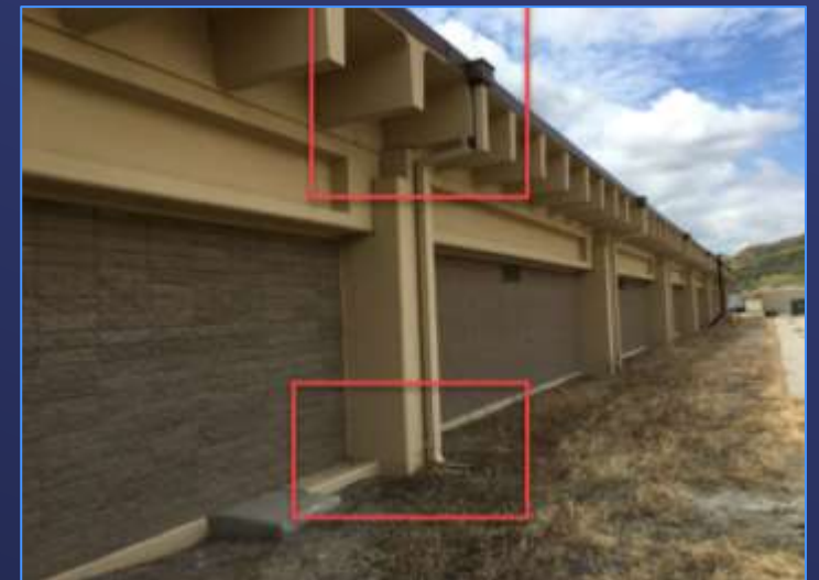
Examples of Areas to be Strengthened