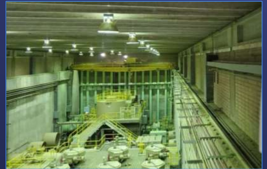
Foothill HEP Interior View