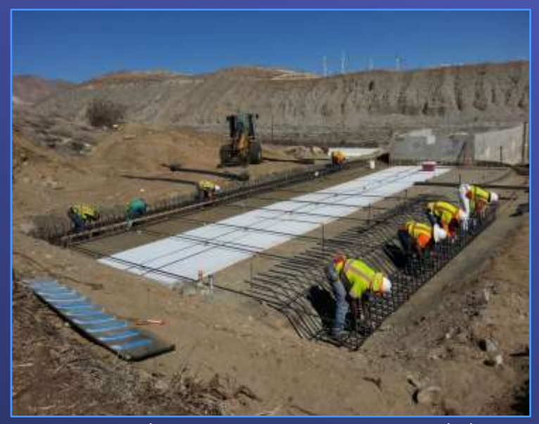
Typical Concrete Protective Slab