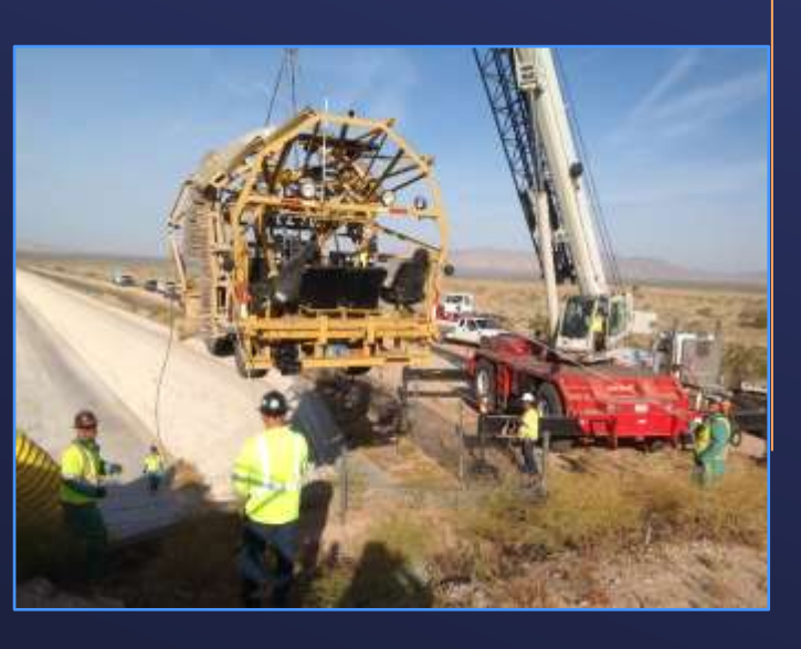
Tunnel Cleaning Machine