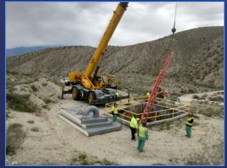
Transition Access Structure Item # 7-1 Slide 5