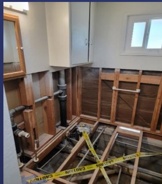
Before and After Bathroom Renovation