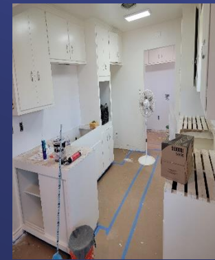
Before and After Kitchen Renovation