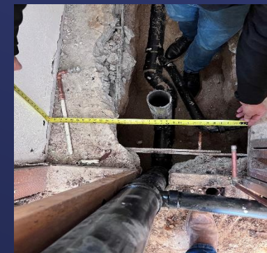
Major Plumbing Repairs