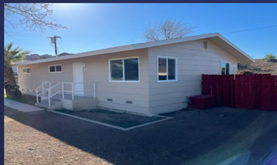
Exterior paint and new windows