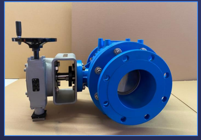
Triple Offset Ball Valve