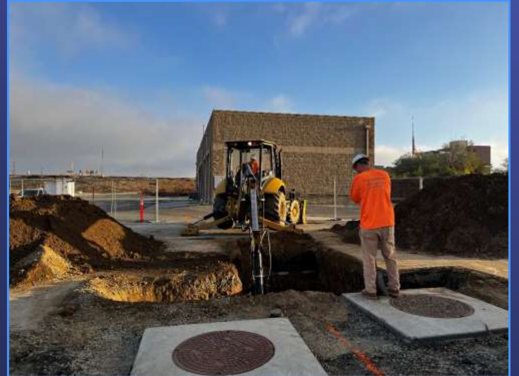
Excavating to construct electrical ductbanks A-1 and A-2 at Mills plant