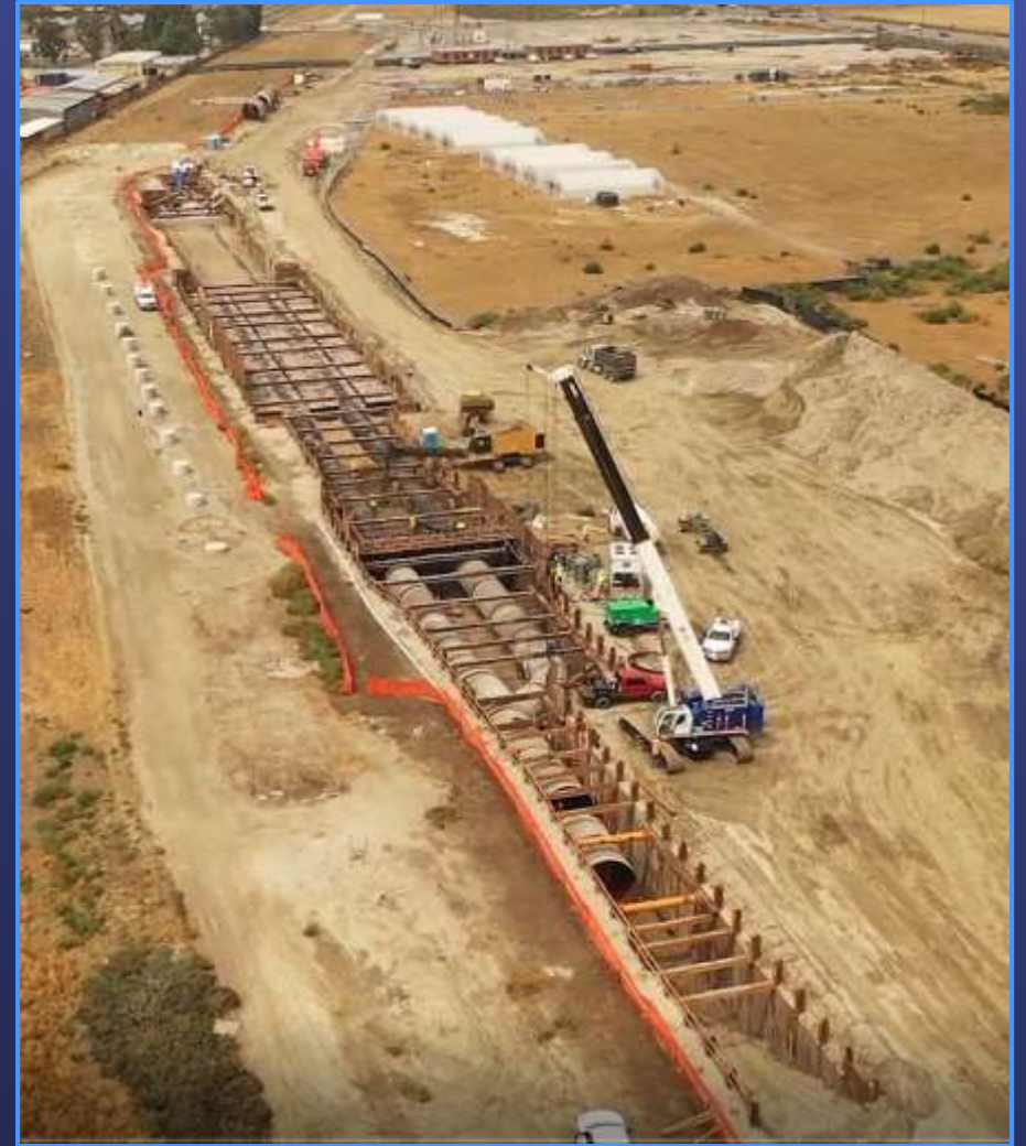
Aerial overview of project site