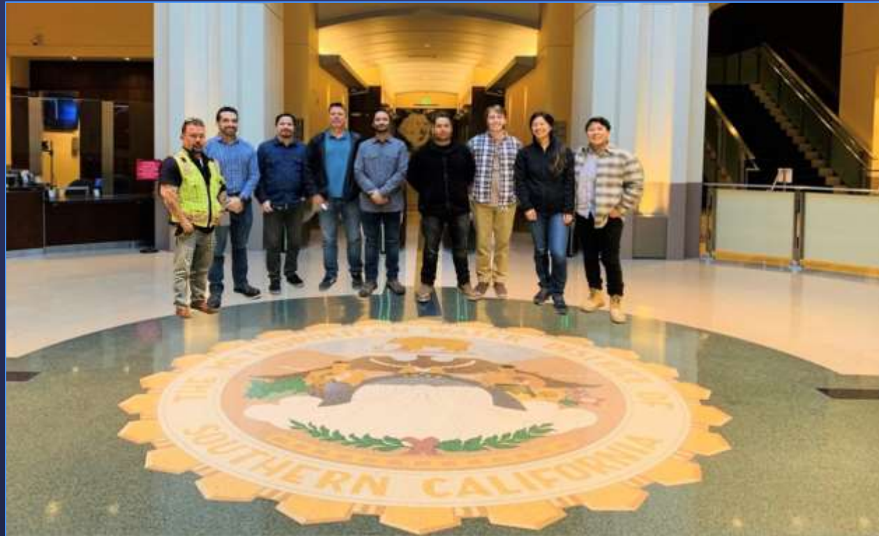
Headquarters Improvements - Construction Management Team