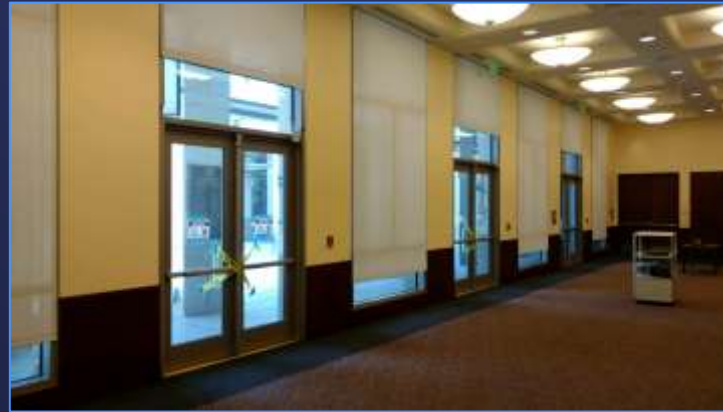
Stage 1 Upgrades