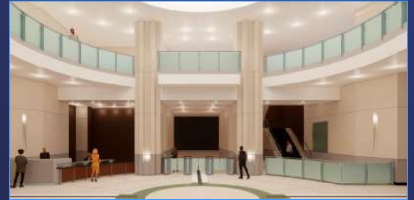
Stage 2 Upgrades