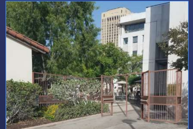
Renderings of courtyard security fencing & gates