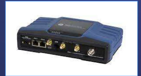
Licensed 900 MHz + cellular