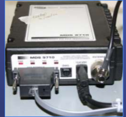
Current AMR radio modem