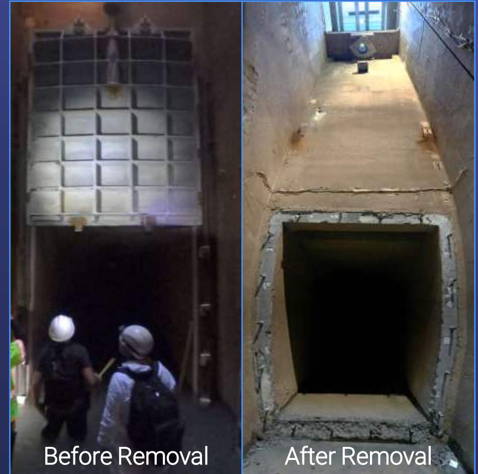
Slide Gate V-03