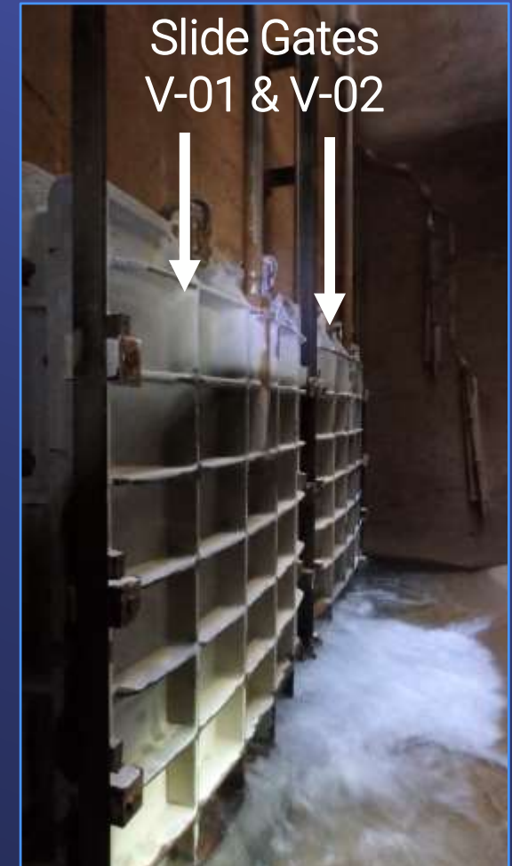
Leakage Past Closed Slide Gates