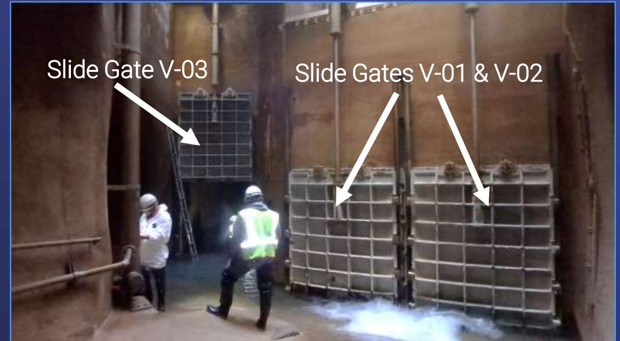
Interior of San Jacinto Diversion Structure