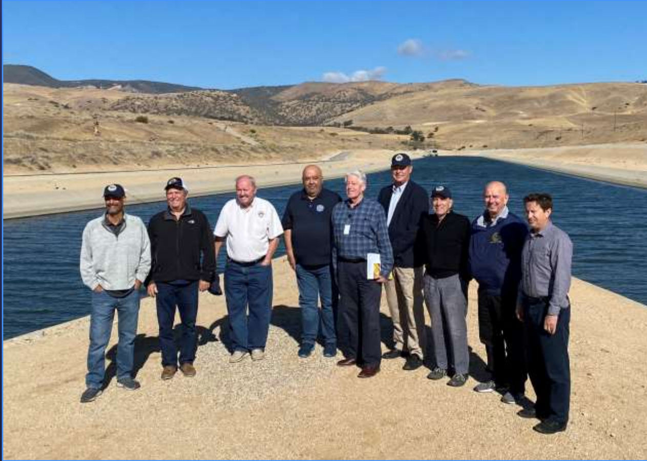
State Water Project Aqueduct Bifurcation Structure