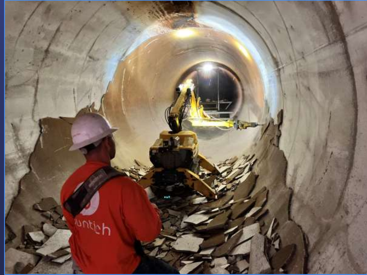
Demolition of Cement Mortar Lining