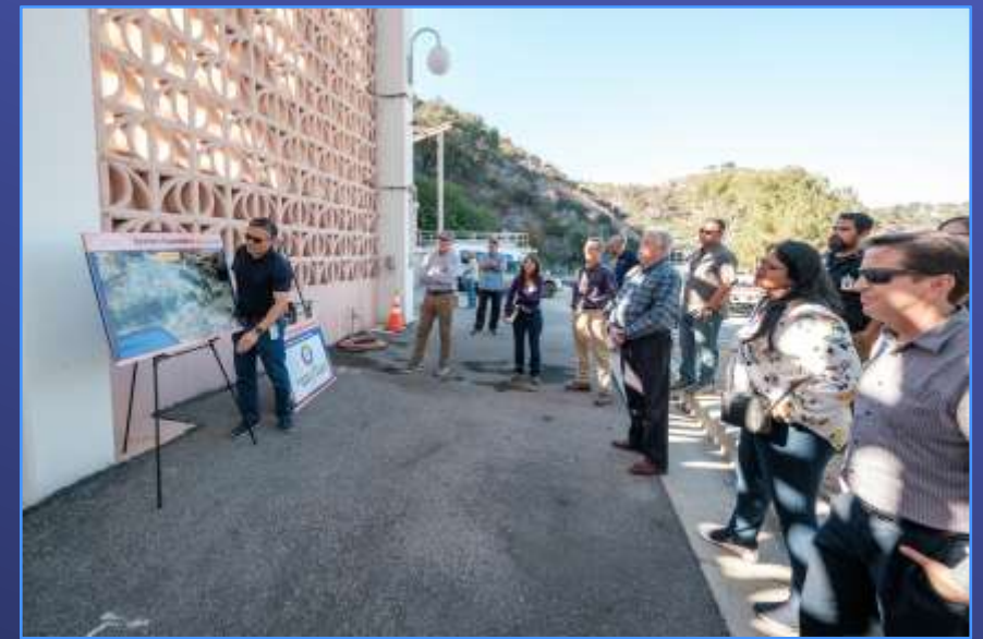
Sepulveda Feeder Operations