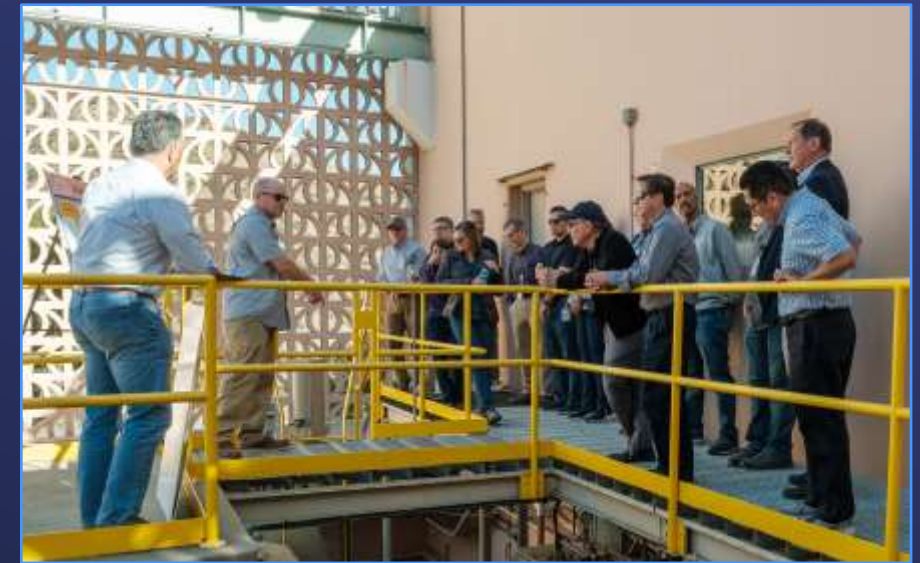
Sepulveda Pressure Control Structure