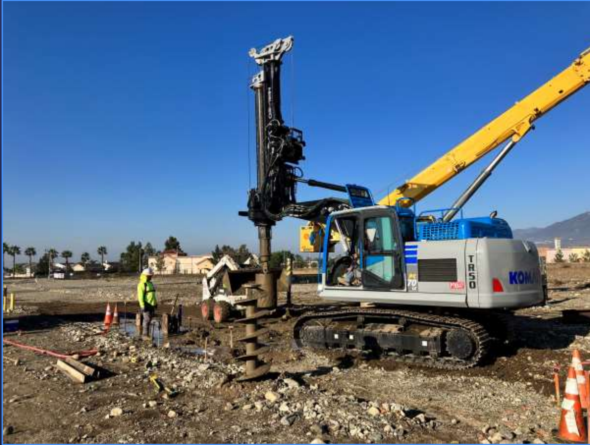
Beam and Plate Installation for Pit Shoring