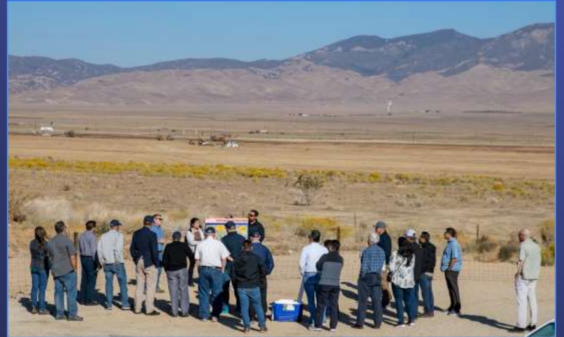
AVEK Water Storage Program