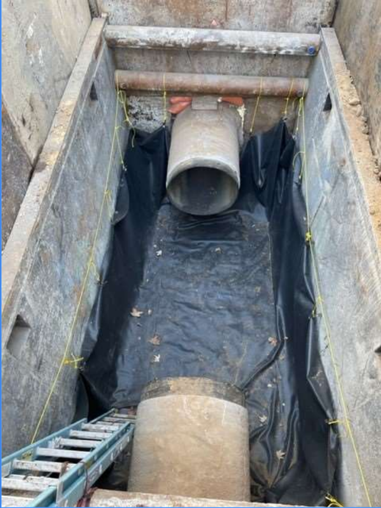
Pipe Access Pit – Pipe Section Removed