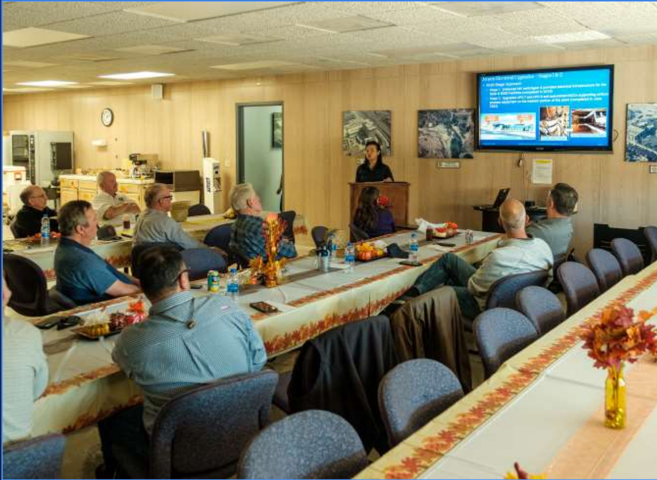
Presentations at the Jensen Plant