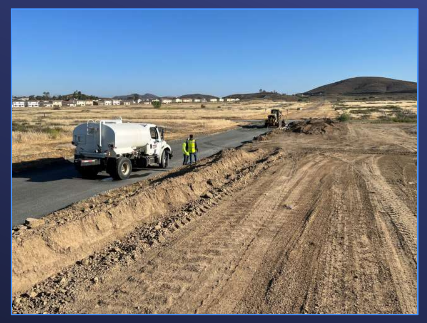
Contractor installing crushed aggregate base for fire access road at Skinner WTP