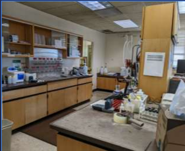
Water Quality Lab in Admin. Bldg.