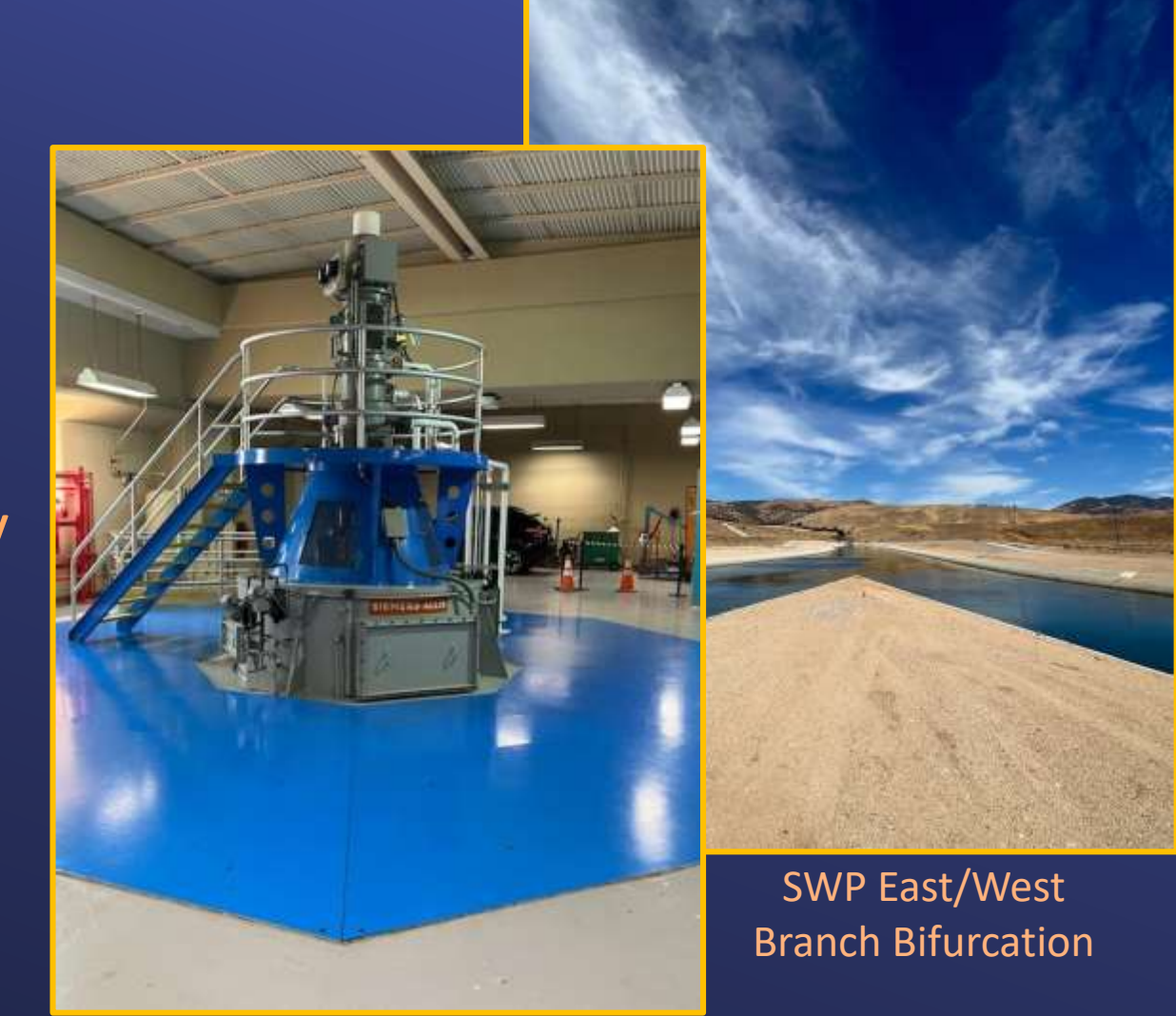
SWP Oso Pump Plant