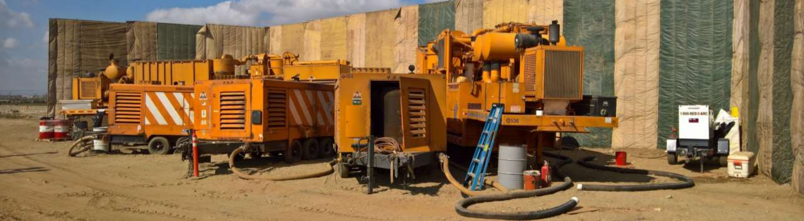
Contractor equipment behind sound barriers