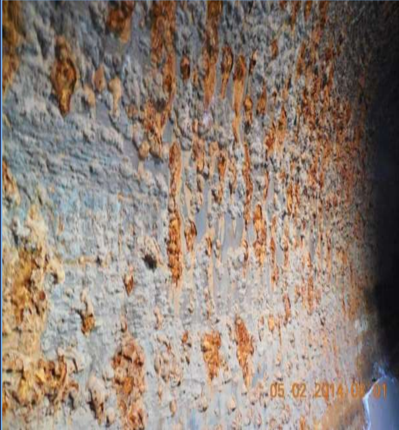
Condition Before Abrasive Blasting