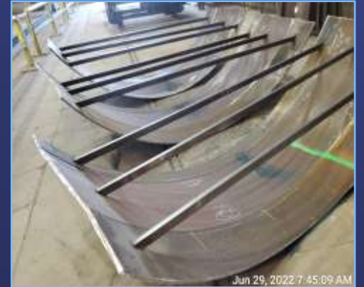
Etiwanda Steel Pipe in Fabrication