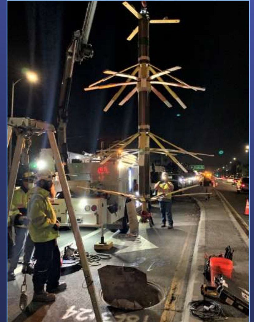
Insertion of Pipe Diver for Electromagnetic Inspection of Second Lower Feeder Reach 3B