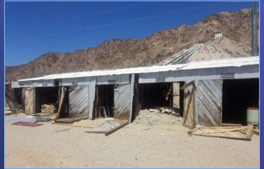
The Dilapidated Existing Buildings