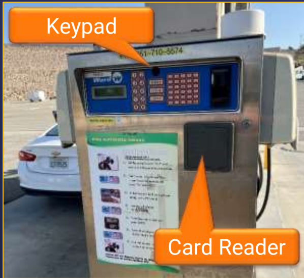
FMS terminal at Lake Mathews

Fuel Management System is designed to automate and control the dispensing of fuel