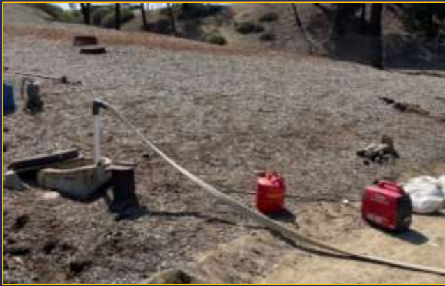
Small portable generator for dewatering at Skinner Water Treatment Plant