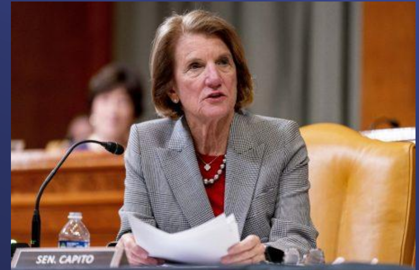
Senator Shelly Moore Capito (R-WV) Ranking Member