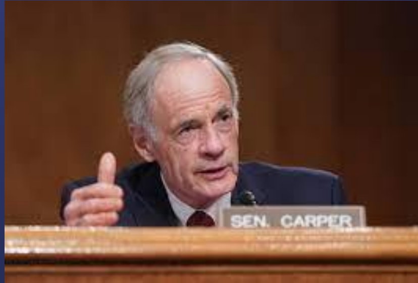
Senator Tom Carper (D-DE) Chairman