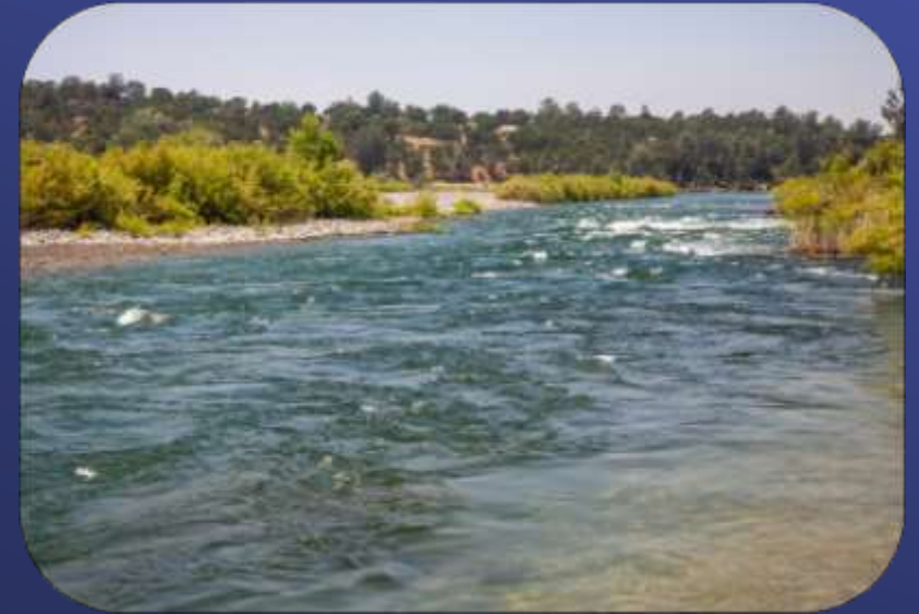
Tributary / Delta Governance Entities