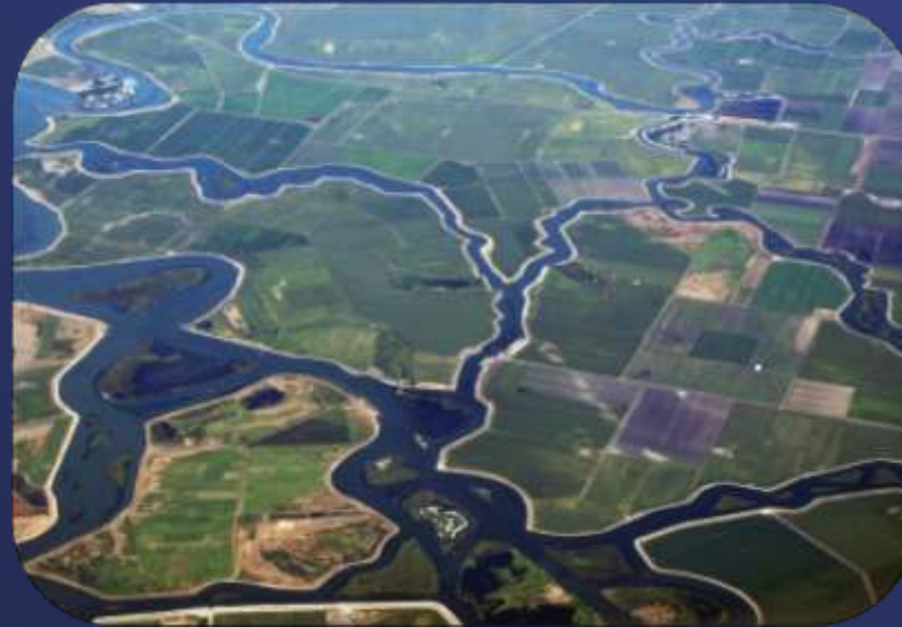
Systemwide Governance Committee