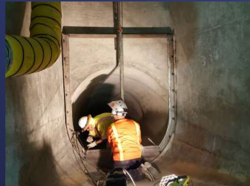
Palos Verdes Reservoir Bulkhead Installations