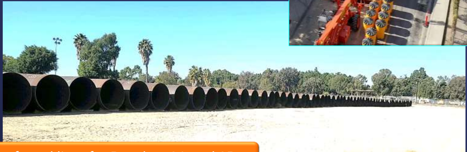
Unloading and Storage of steel liner for Reaches 3A and 3B