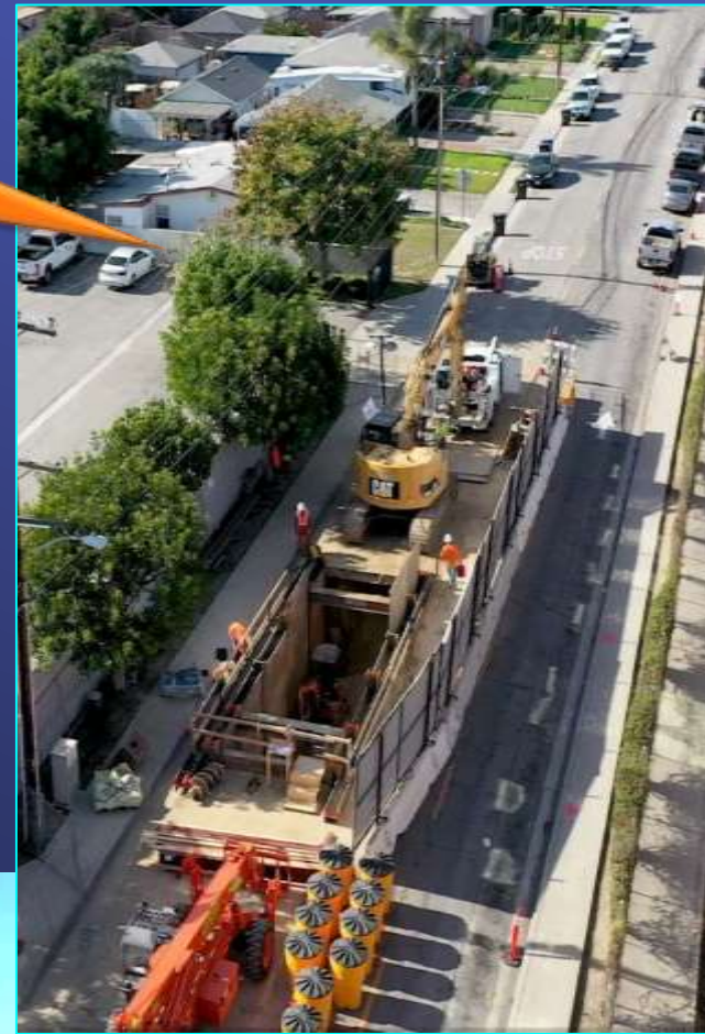
Typical Pipe Access Site