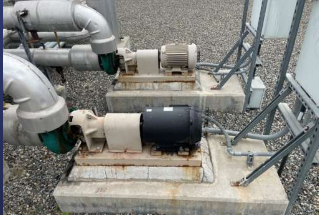
Existing chilled water pumps