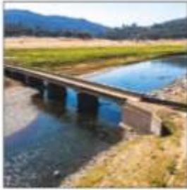
A FORMERLY submerged bridge is exposed as water levels recede at Folsom Lake.

Specifically, the order requires that urban water suppliers activate "Level 2" of their locally customized contingency plans, meaning they must prepare for a shortage of up to [See Water, B5]