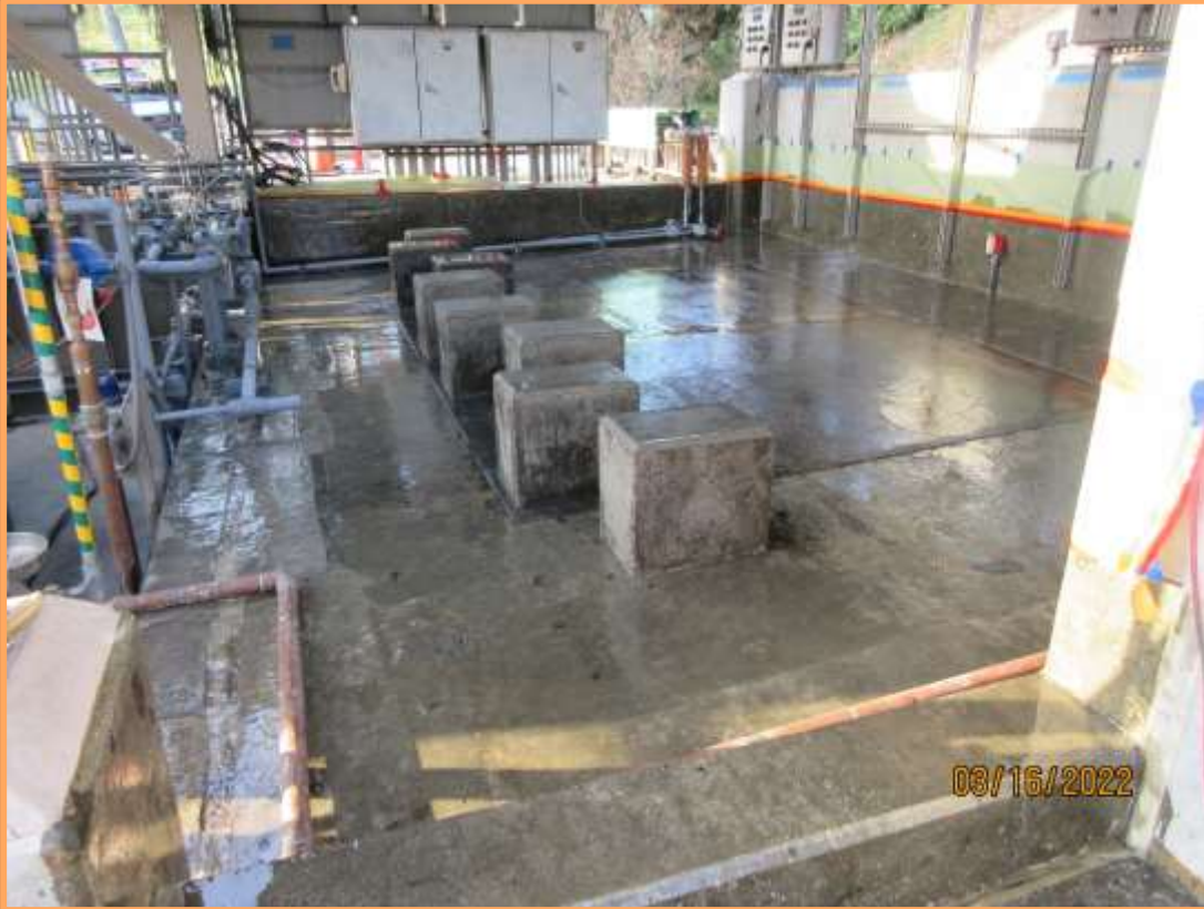
New Pump Pedestals and Control Panels Installed and Coated