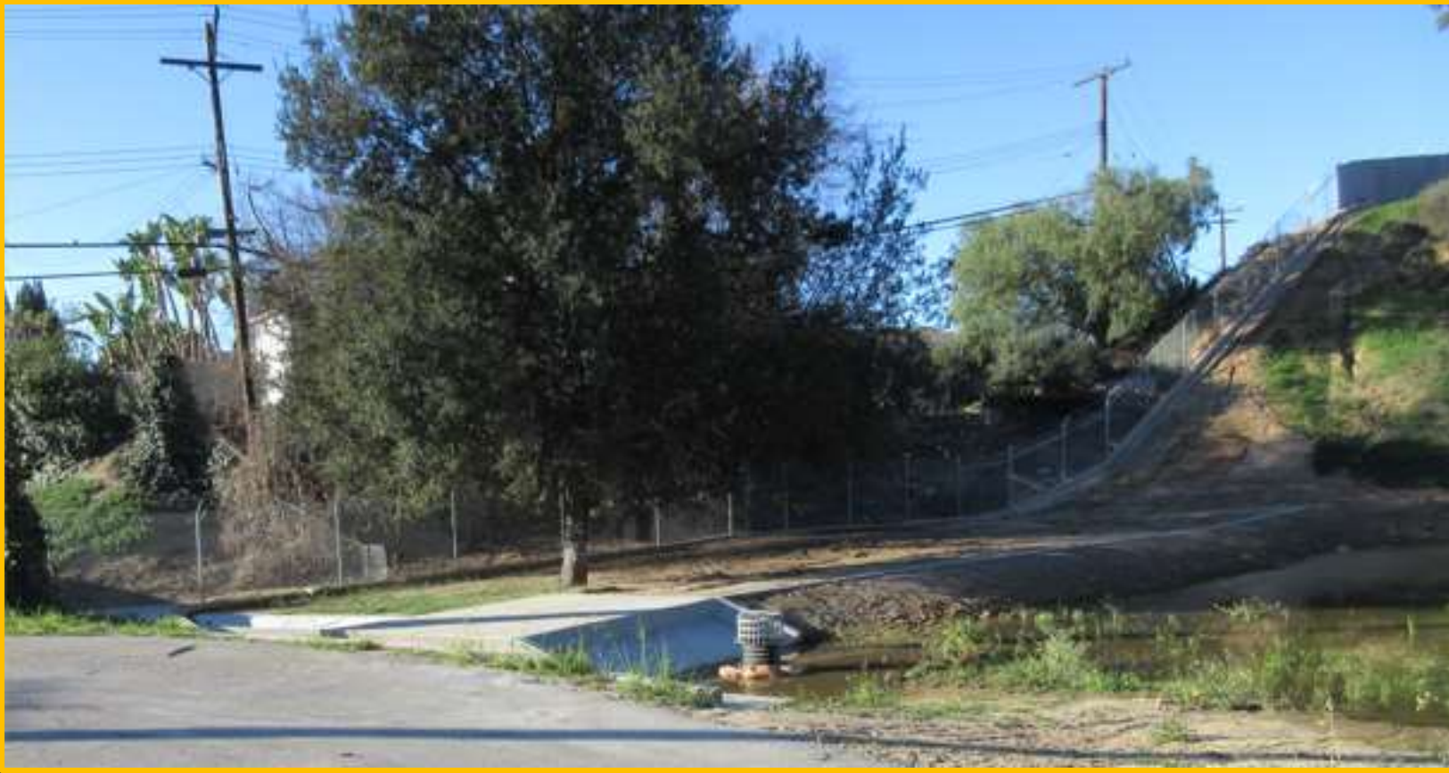
Garvey Area 8 – New Detention Basin and Perimeter Fencing