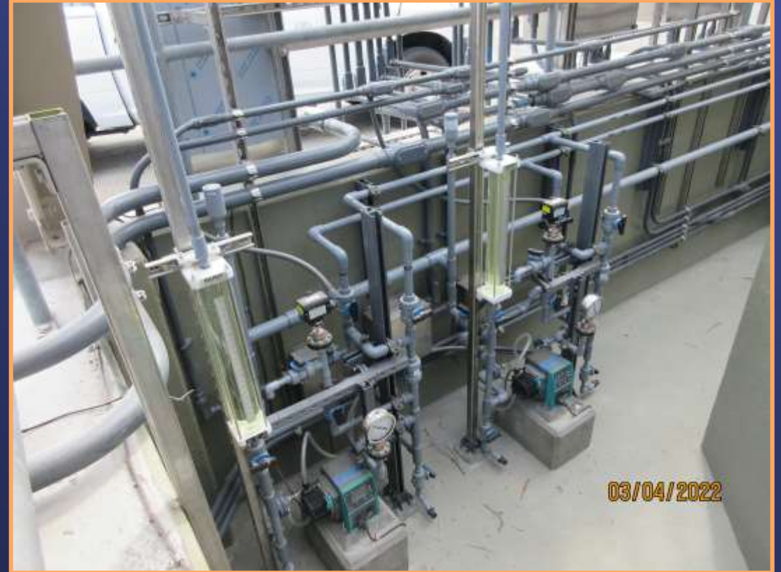
Temporary Hypochlorite Feed System Installed and Operational