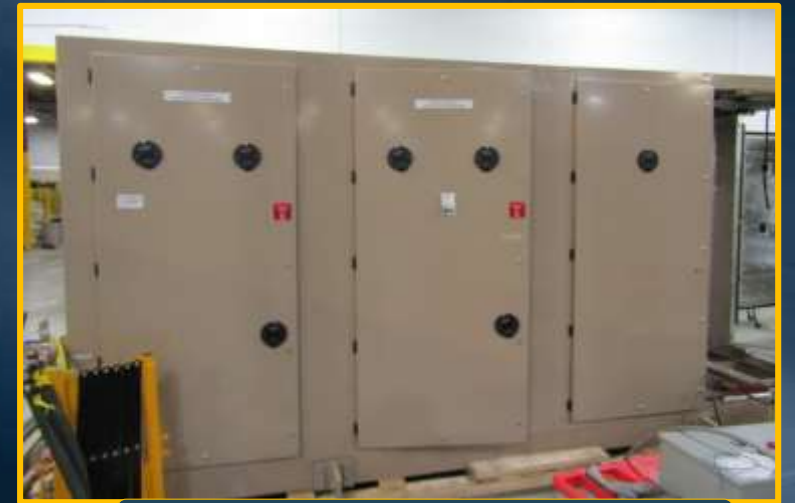
New Power Supply Units (PSU)