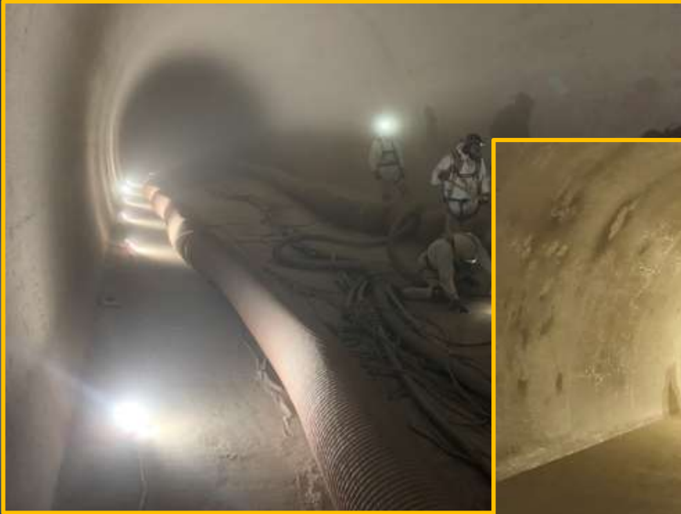
Post Blast Cleanup