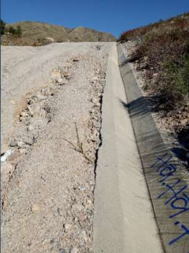
Eroded Access Road