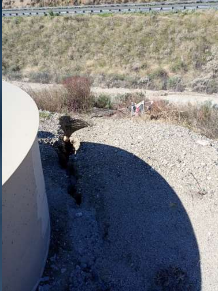
Erosion Adjacent to Accessway