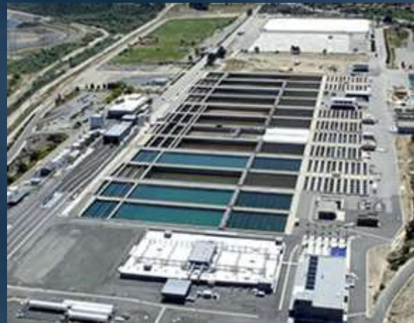
Compliance with Drinking Water Regulations