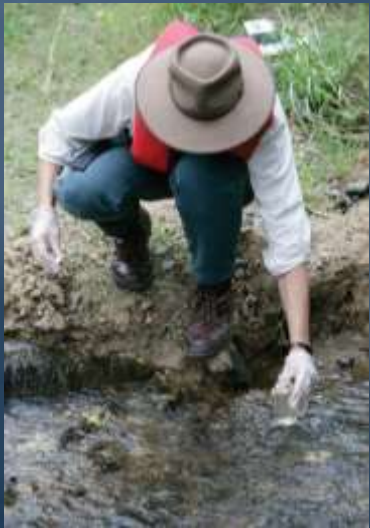
Monitor & Sample