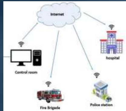
Disseminate Data & Maintain Database