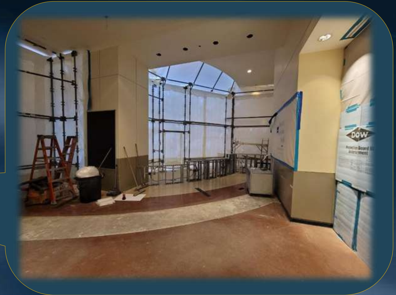
The Security Desk Area (Inside the Dust Containment) under Construction