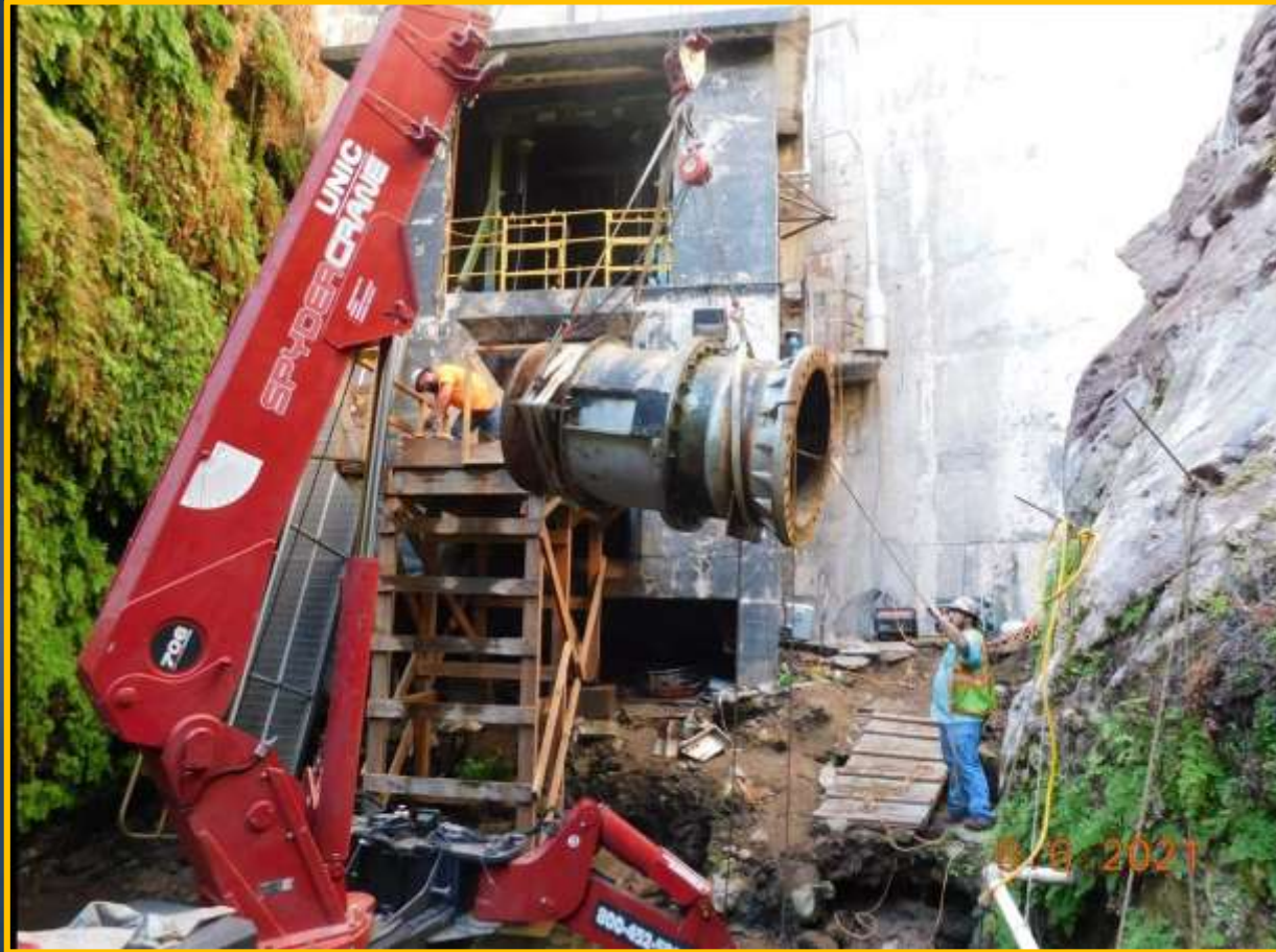
Removing the Old Valve