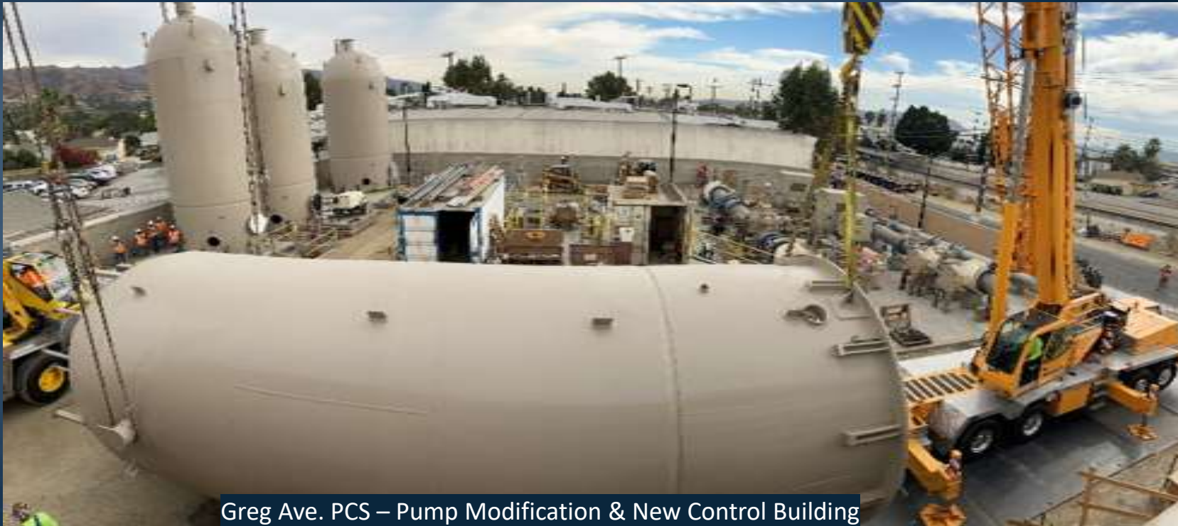
Greg Ave. PCS – Pump Modification & New Control Building