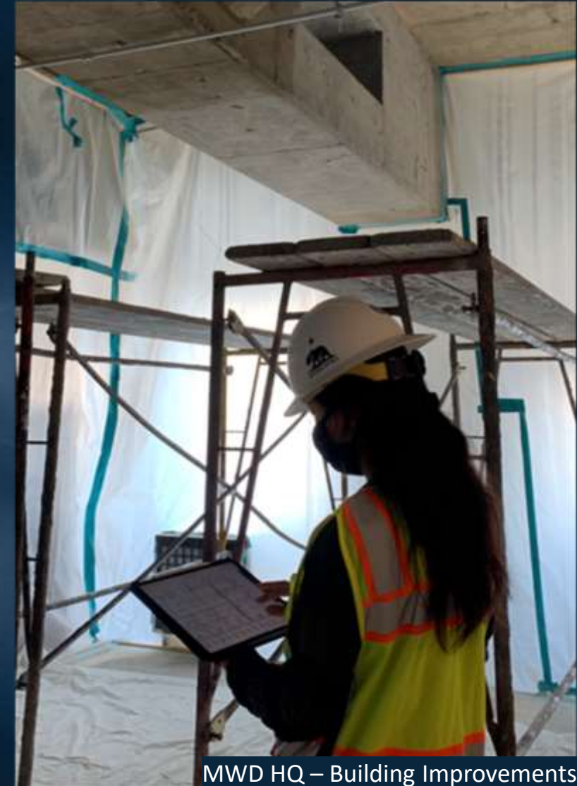
MWD HQ – Building Improvements