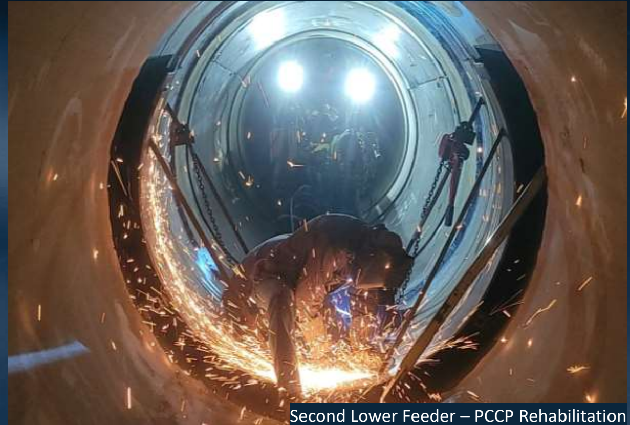
Second Lower Feeder – PCCP Rehabilitation