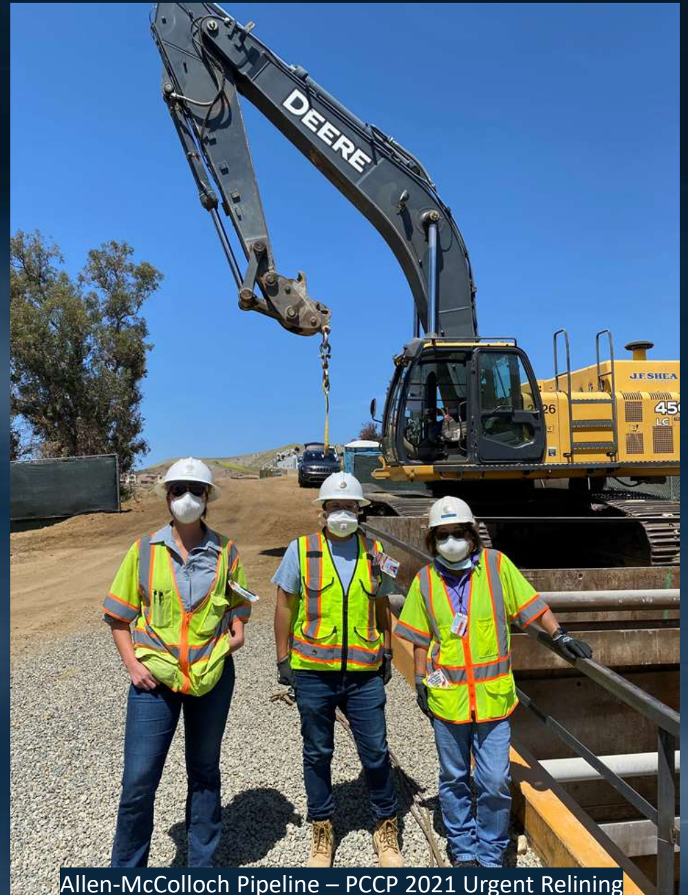
Allen-McColloch Pipeline – PCCP 2021 Urgent Relining