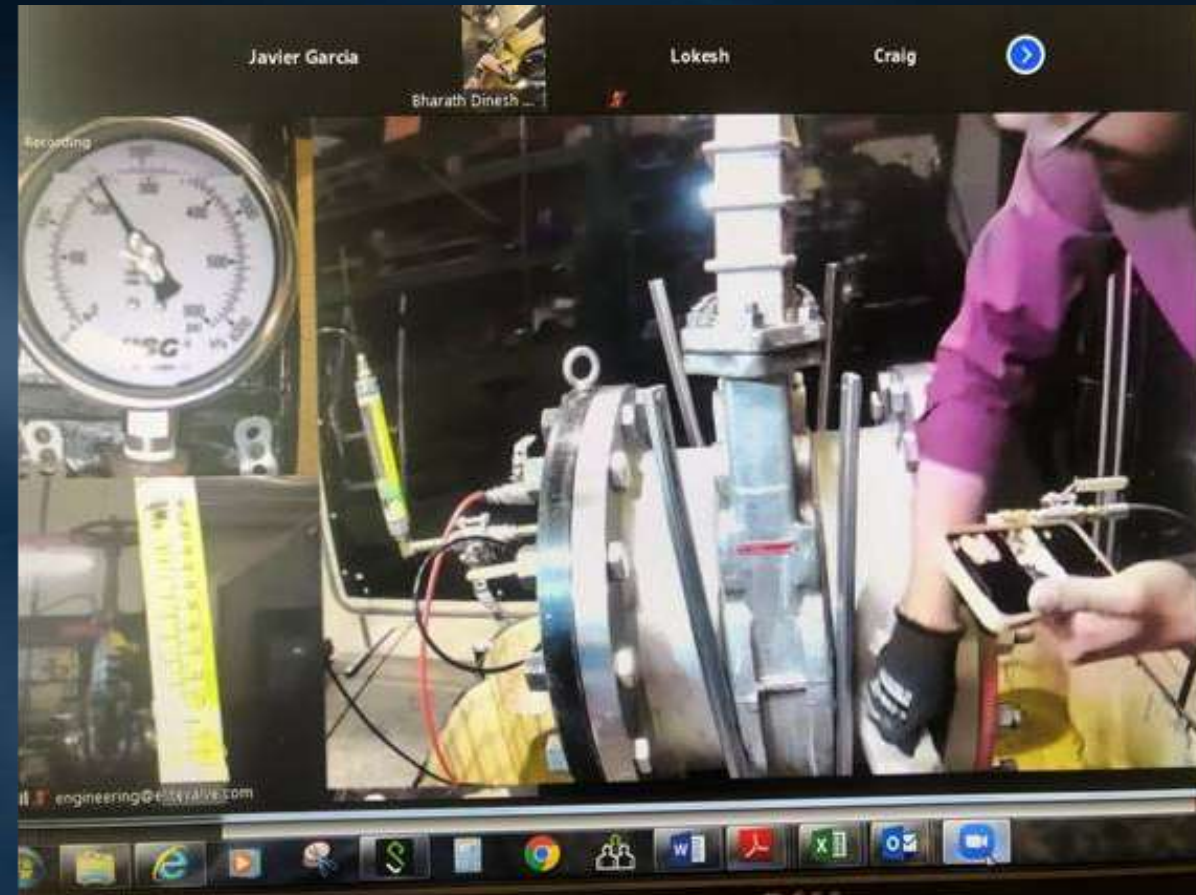
Rite Pro Co. – CRA Pumping Plant Sump Replacement