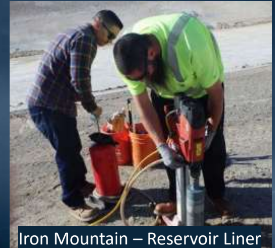
Iron Mountain – Reservoir Liner