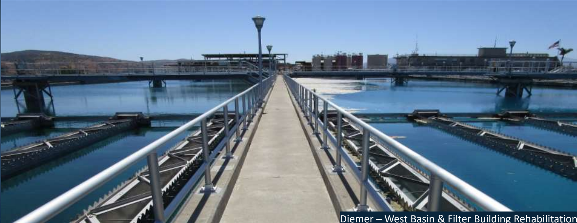
Diemer – West Basin & Filter Building Rehabilitation