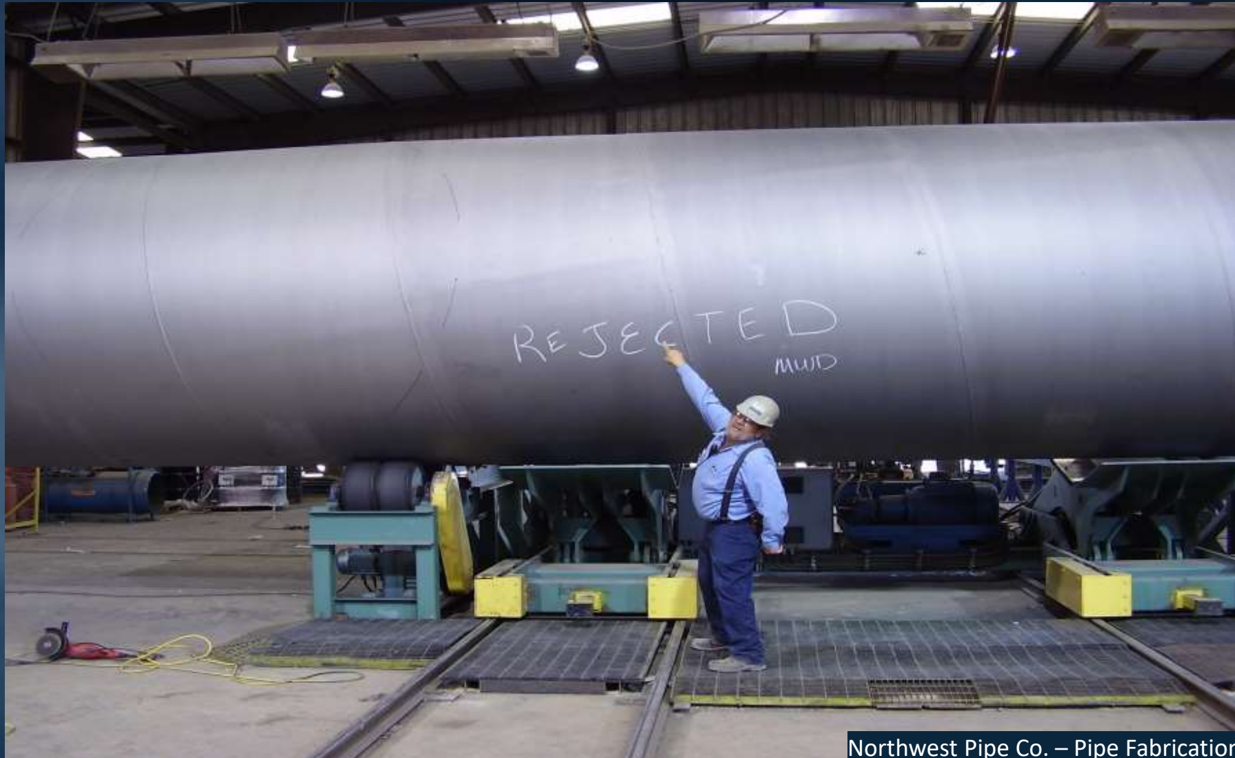
Northwest Pipe Co. – Pipe Fabrication