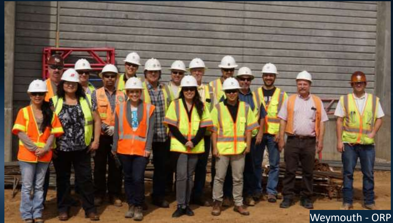
Weymouth - ORP