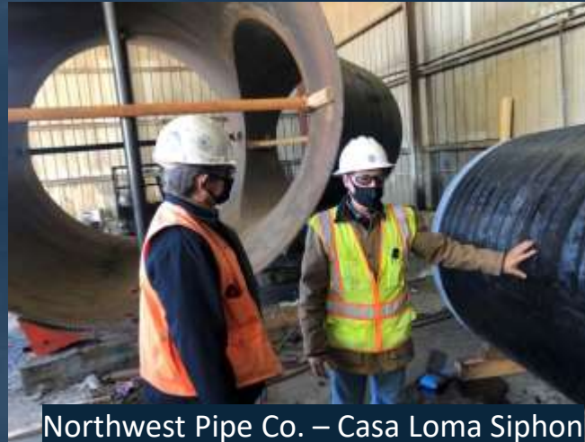
Northwest Pipe Co. – Casa Loma Siphon