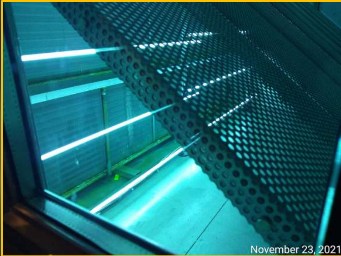
UVC light installation, 5th floor wing