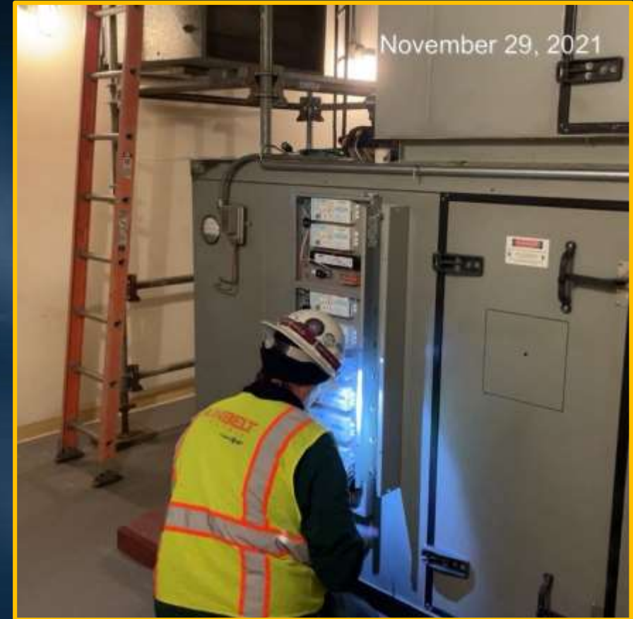
UVC controls in Mechanical Room, 1st Floor