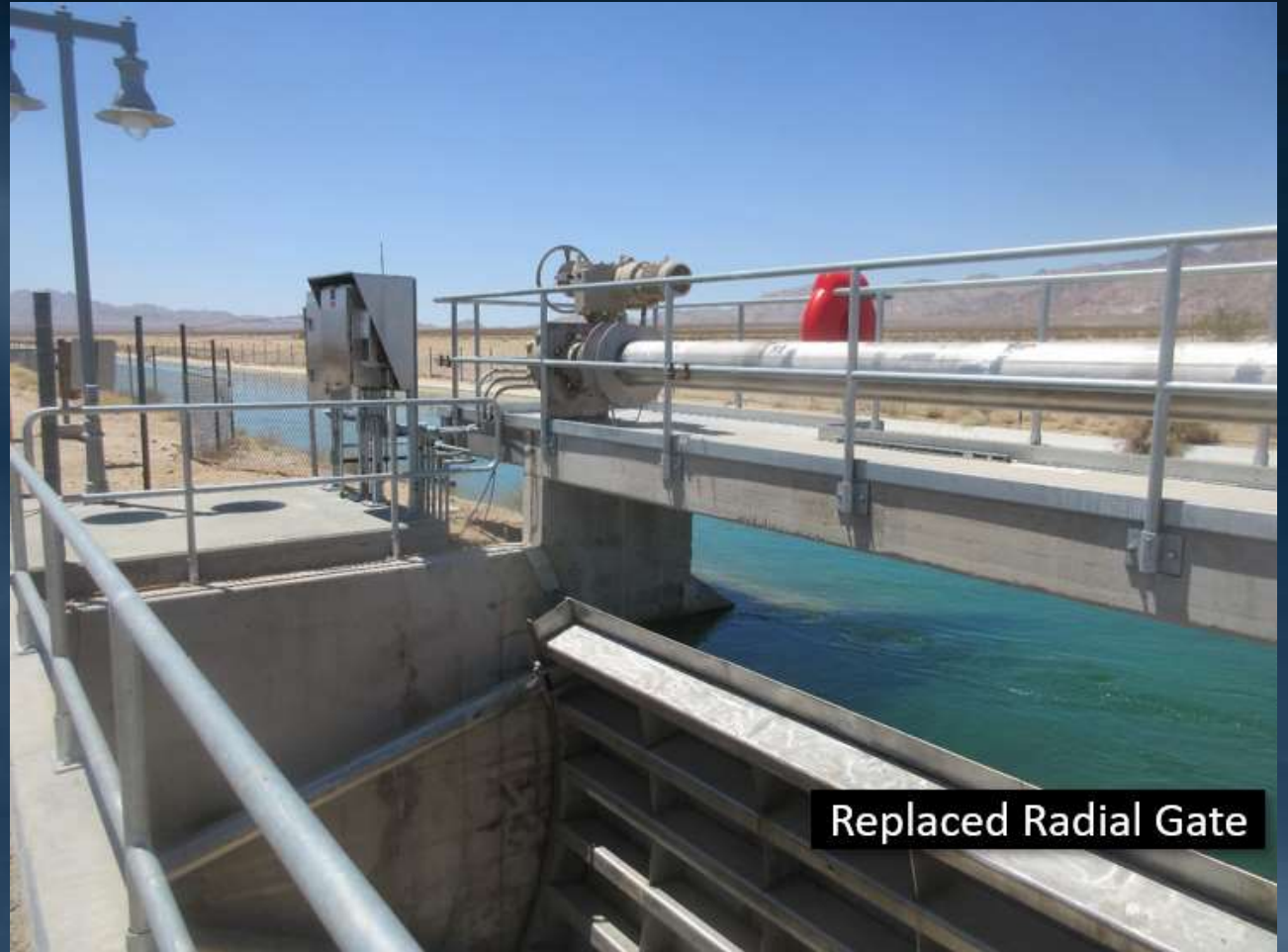
Completed radial gate in operation at Iron Mountain Wasteway