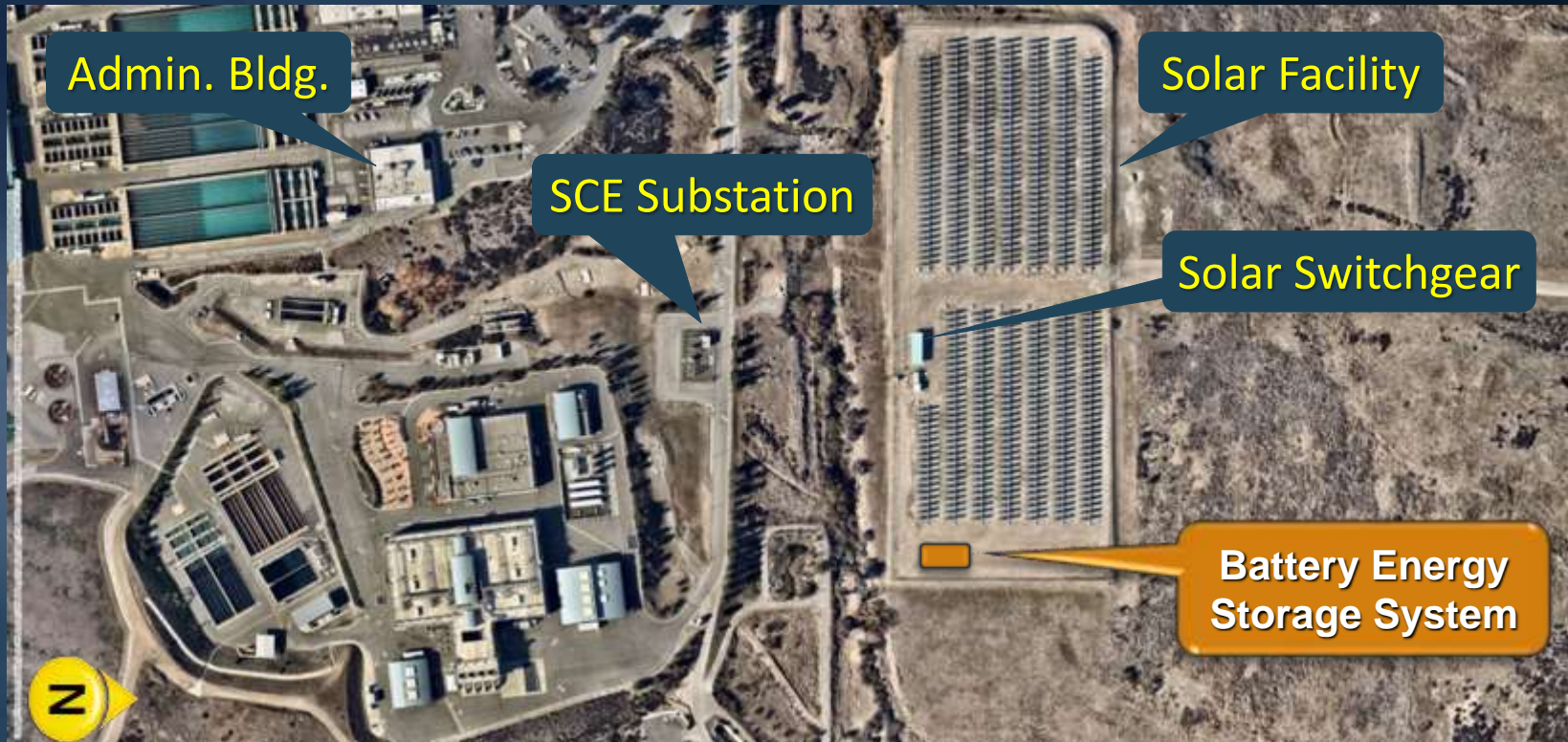
Proposed BESS site location at the Skinner plant