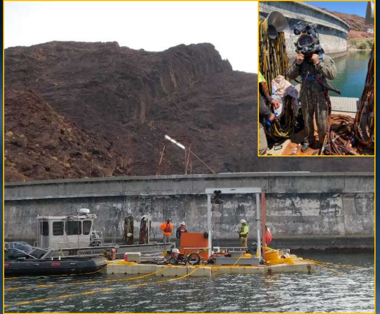
Floating platform for underwater work inset photo: diver preparing to work on isolation device