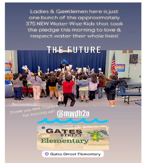
Social Media post featured Gates Elementary students taking a water conservation pledge.

Showcased student art at Rowland Water District.