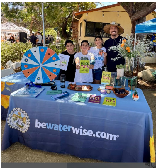
Bewaterwise exhibit table at Tarzana Native Plant Fair

DVL Inspection Trip with Directors Fellow and DeJesus (March 20) and Pure Water Southern California Inspection Trip with Directors Dennstedt and Armstrong (March 28).