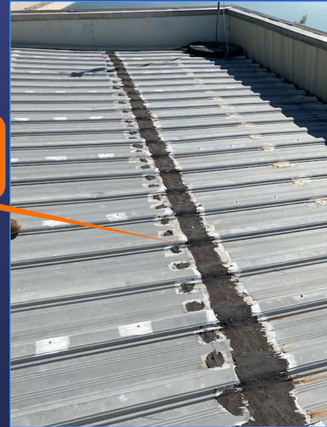
Deteriorating Metal Roof & Temporary Roof Repairs