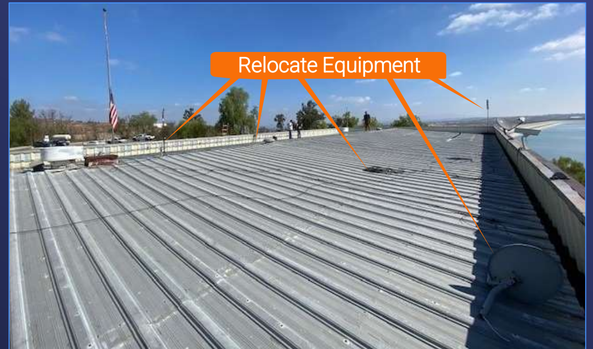
Metropolitan Force Construction