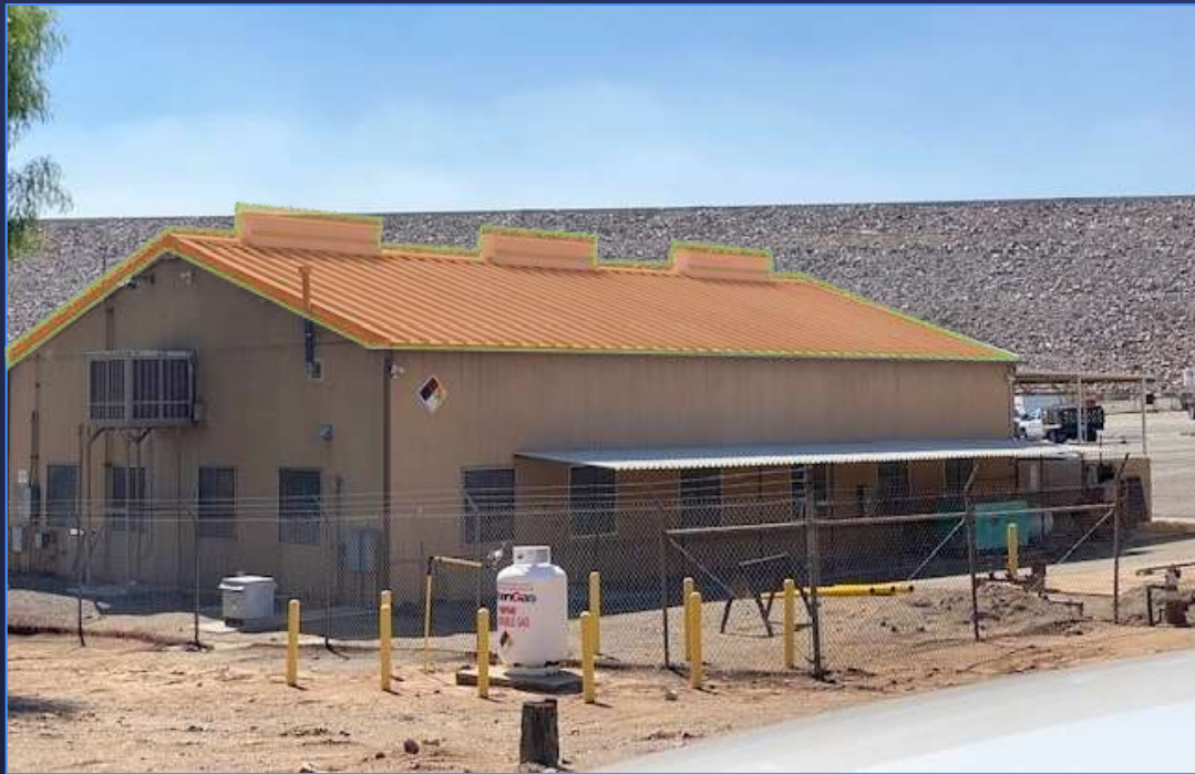
Remove & Replace Warehouse Building Metal Roof & Ventilators