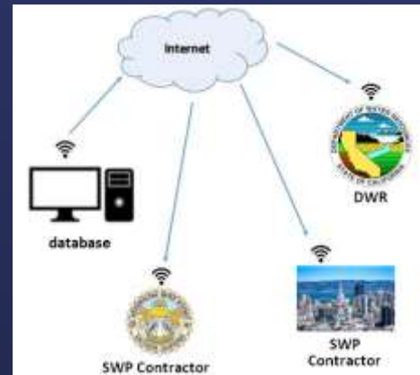
Disseminate Data & Maintain Database