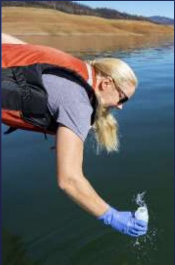
Sample & Monitor