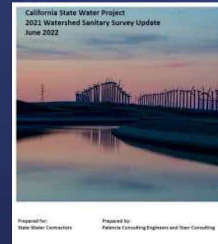
SWP Watershed Sanitary Survey