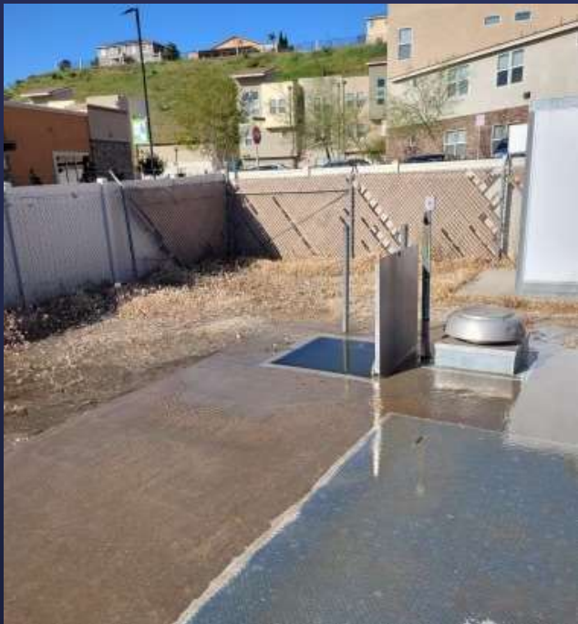
Flooded Structure at DWR's Northpark Valve Vault