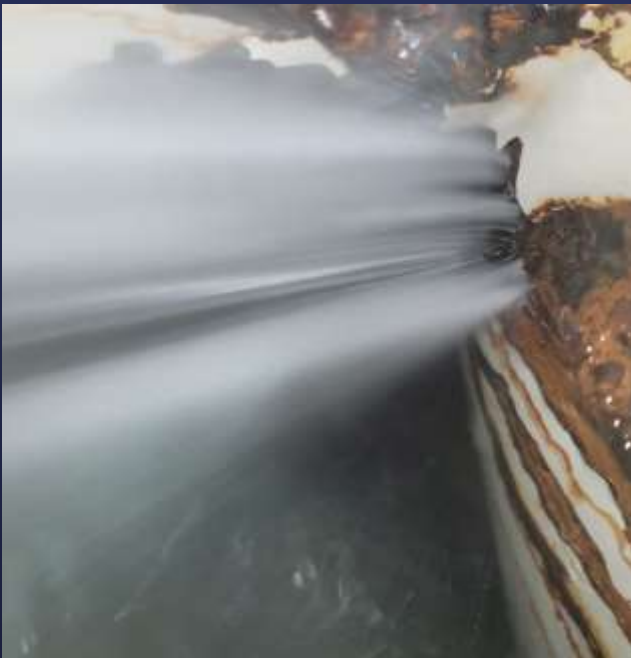
Leak on DWR's 12" Bypass Line at Northpark Valve Vault