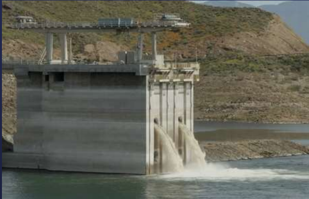
Article 21 Deliveries to Diamond Valley Lake on March 27, 2023