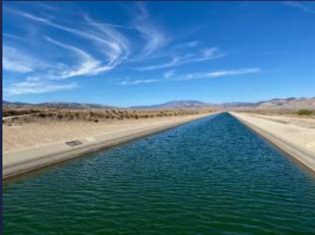
East Branch of California Aqueduct