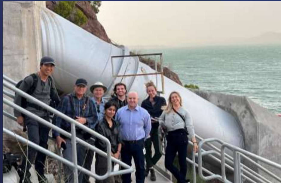
Media Tour Participants at Intake