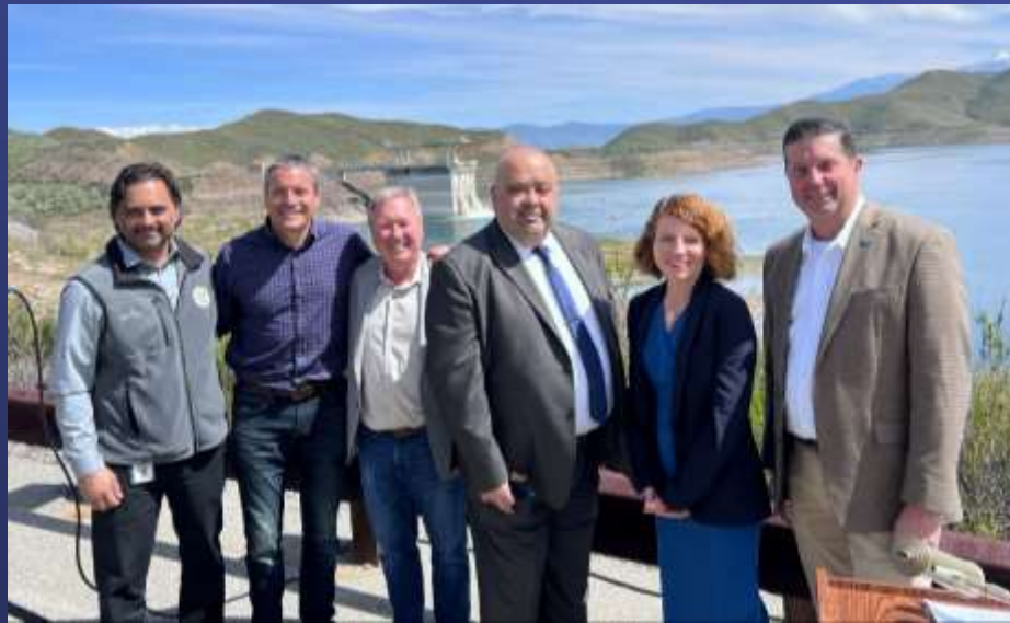
MWD and State Officials at Diamond Valley Lake Press Conference