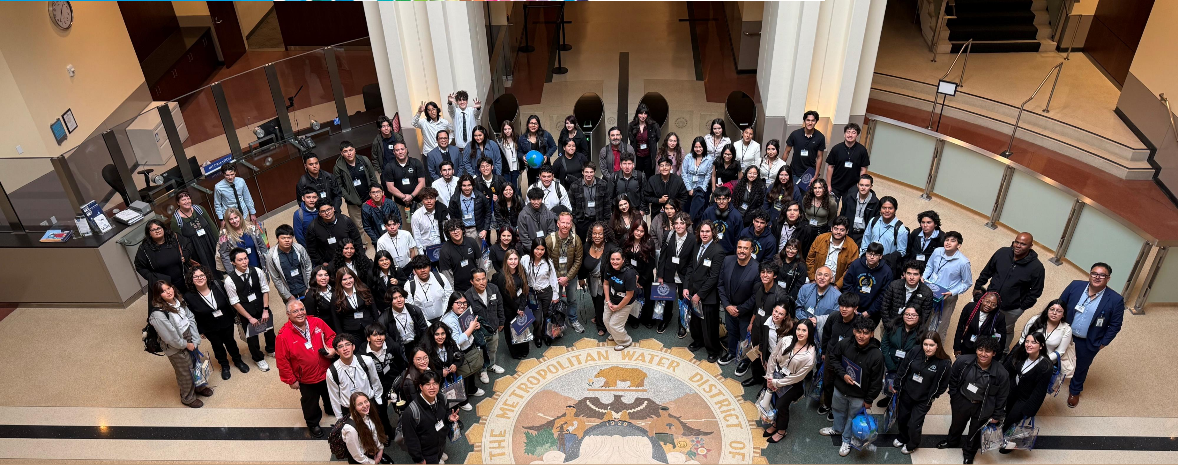
100 student participants