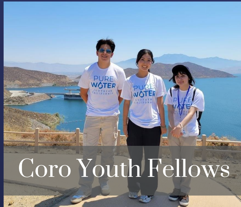
Coro Youth Fellows