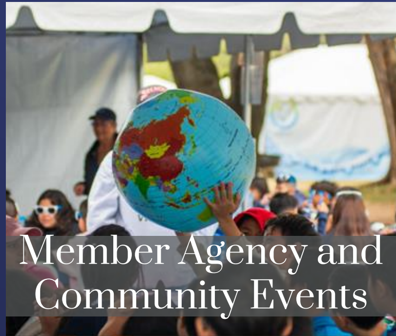
Member Agency and Community Events