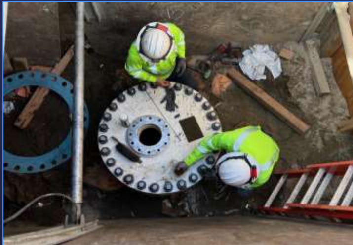
Met Forces Repairs