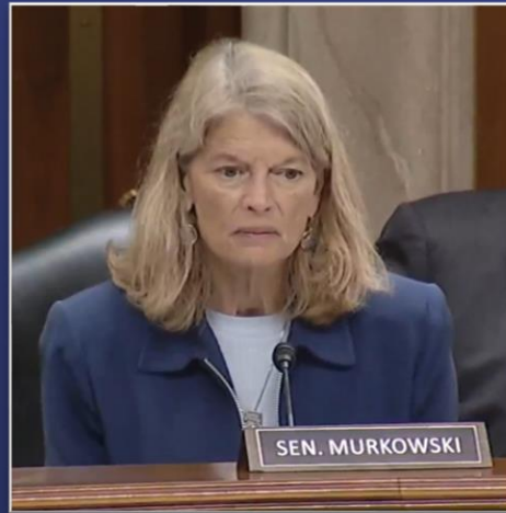
Sen. Murkowski (R-AK)