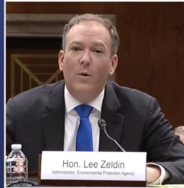
Lee Zeldin, EPA Administrator