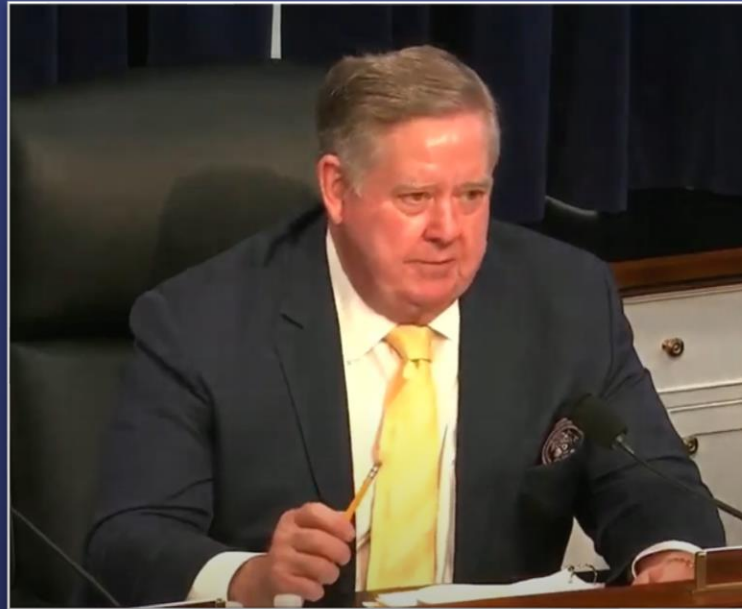
Rep. Calvert (R-CA)